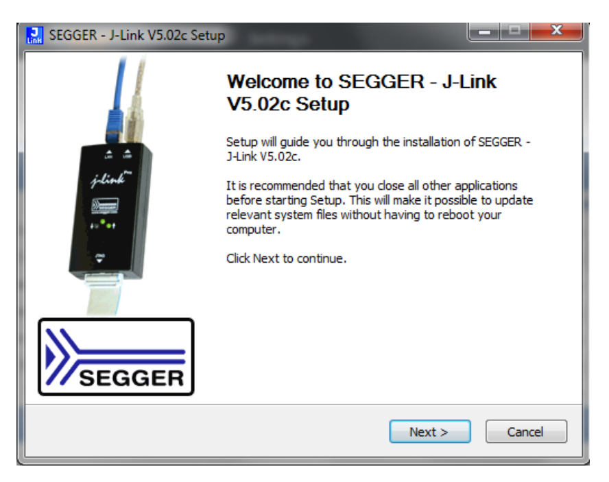
Figure 3 - Run the J-Link Flash Programmer Installer

Download the J-Link installer available here <u>https://www.segger.com/jlink-software.html</u>. Unzip the setup folder and run Setup_JLink_xxxx.exe , where "xxxx" is the software version. The version package tested during writing this document is v5.02c.