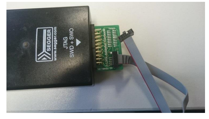
Figure 2 - J-Link Debugger and its SWD Connector

The connector is sold with a white full pin (pin 7) to be used as keyed, it is not needed for the ICM-30630 shield, the user can safely remove it.