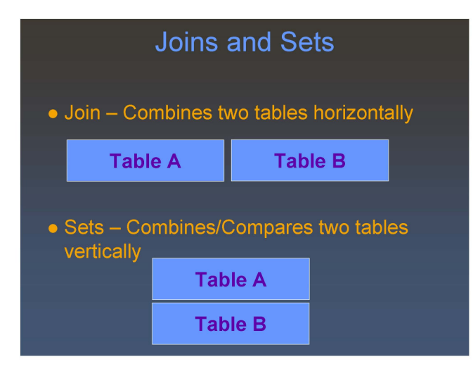
Figure 1: Joins and Sets

Set operations can also be done using SQL. EG 4.1 is much better working with joins than with sets, but if you start to use EG and understand what is going on, you can use that code and extend it by adding your own coding. Because having both joins and sets are useful for many data manipulations, and because both can be coded in Proc SQL, it makes sense to use the point-and-click environment of EG to learn how to do joins, then extend your abilities using the code provided by EG, along with some SAS keywords to cover set operations.