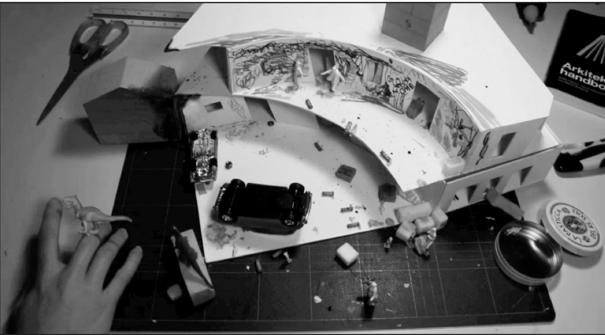
Figure 2. Four frames from 'Making a Move'; showing how a building changes over time

experience with the technique (see Fallman & Moussette, 2011) and with group dynamics in general, we knew that up to ten people in each group were probably going to be too many, especially since the groups had relatively little time to complete their tasks. Our experience is that smaller group sizes (of about 5-6) are preferred.