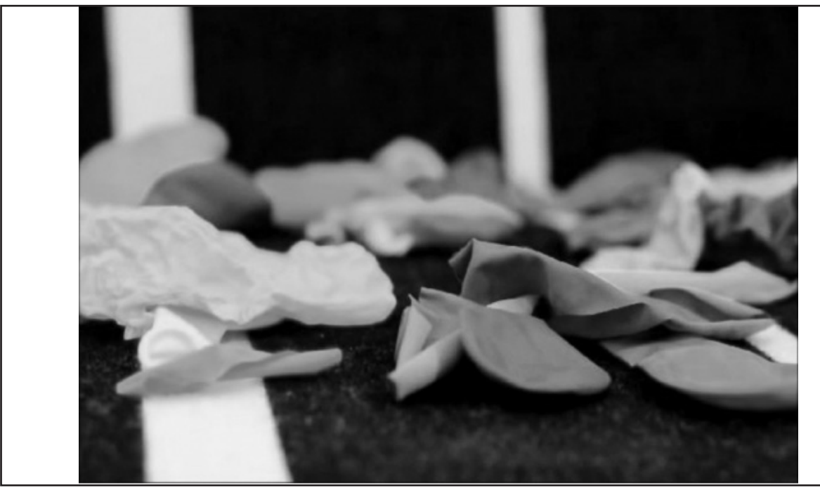
Figure 3. Four frames from another animation produced during the course, entitled 'Power Nap'

One of the groups had the initial idea that they would leave the provided default setup altogether and just use the camera on one of their smartphones to record the entire animation. After some time experimenting with this, they returned to the setup. When asked why, they provided slightly diverse answers but one of them involved the problem of lacking live preview — i.e. in real time being able to see what the camera sees from the same software that is used to capture the frames.