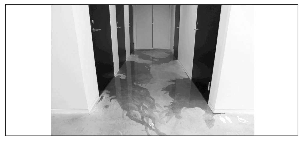
Figure 5. A single frame from an animation produced during the course (untitled), where the students used stop motion to allow water to defy gravity

As a general conclusion, most students were surprised how much work actually goes into producing a minute-long stop motion animation. Although stop motion sequences may look trivial, they still require substantial investment in time, involvement, and engagement. However, what you dedicate in time is balanced by the rather unrestricted creativity of the medium (Fallman & Moussette, 2011). The animations produced were very varied and presented ideas that would have taken weeks or months to realise in another way, i.e. through CAD or 3D animation software, using some special effects