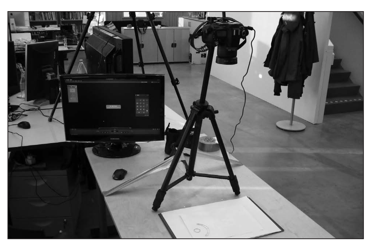
Figure 1. An example of a typical stop motion animation setup

decided on a rather open theme (around the concept of 'growth') and a maximum total running time of one minute for their animations. The intention behind these choices was to provide both guidance and restrictions to the students while still remaining as open as possible to allow for their creativity to flourish.