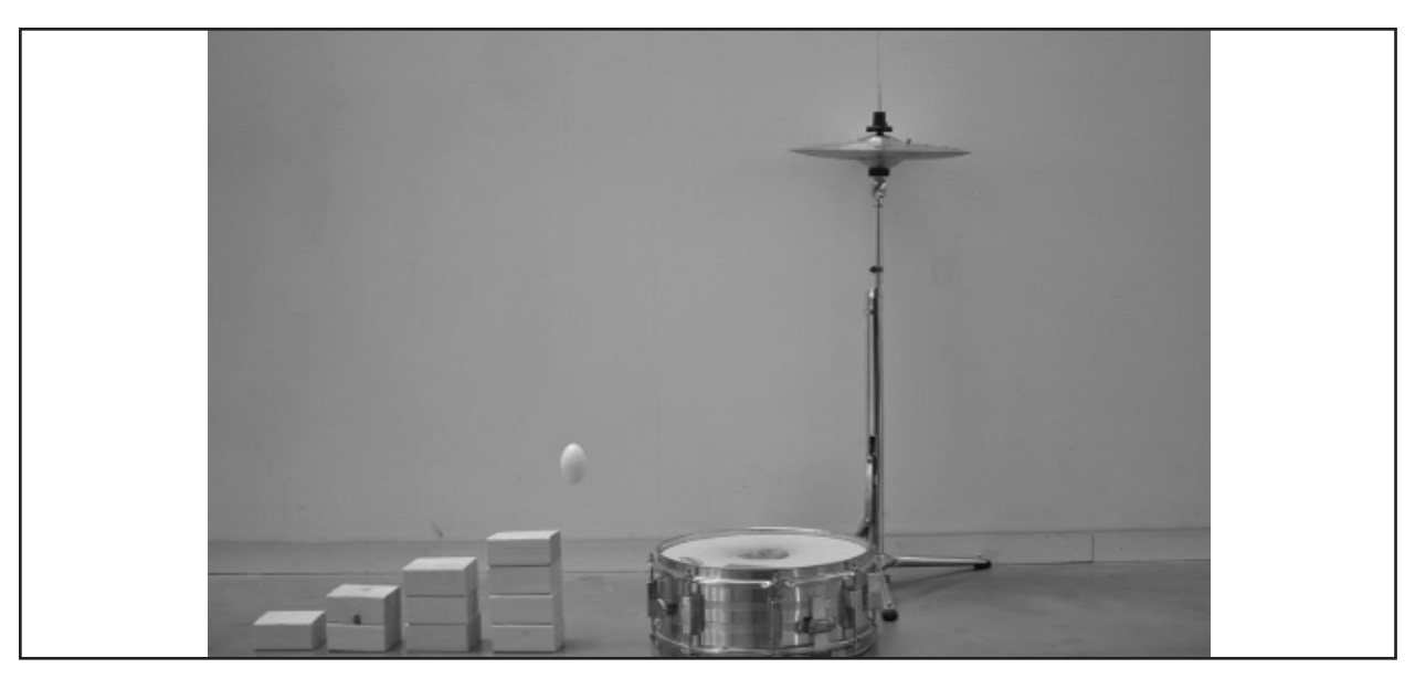
Figure 4. A single frame from an animation produced during the course, entitled 'Eggzit'

Another tendency we saw with the architecture students that we have not experienced previously with interaction design students was that a few groups tended to take the examples we showed during the introduction on day 1 rather literally, i.e. 'reusing' ideas rather bluntly without much tweaking. It is difficult to draw any general conclusions from this, obviously, but we may speculate – partly informed by discussing it with the group – that a reason might be a combination of lack of familiarity with the hardware and software setups and the lack of time to invent an entirely new concept.