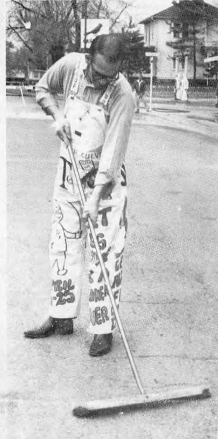
This 1972 photo shows the man who headed the Clean-up Drive that year. Do you recognize him?

Master teachers in Marshall County are working with student teachers from Ball State University this spring helping these seniors to increase their professional skills in teaching