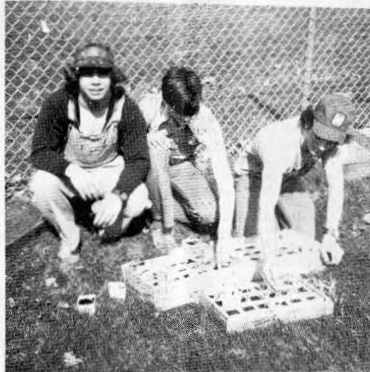
FFA members caring for their plants are left to right,

One of the newest vegetables being tried is Burpee Butterbush Squash.