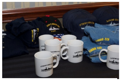
2014 Reunion Ship's Store items

The actual start date of the reunion was Friday, July 25. The Hospitality