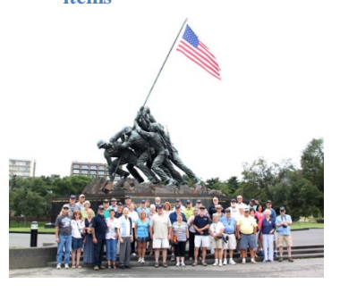
Group photo in front of the Iwo Jima Memorial

tour of various military monuments and memorials.