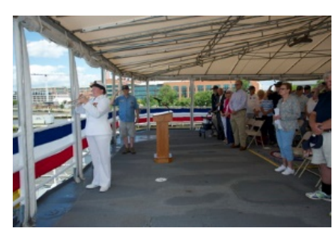
Standing at attention as Taps is played

That was the official end of the 2016 Reunion. However events for the following couple of days had been planned including a tour of Annapolis on Tuesday and a river cruise and tour of Mount Vernon on Wednesday. Pictures of these events can be seen on the website. Wednesday evening