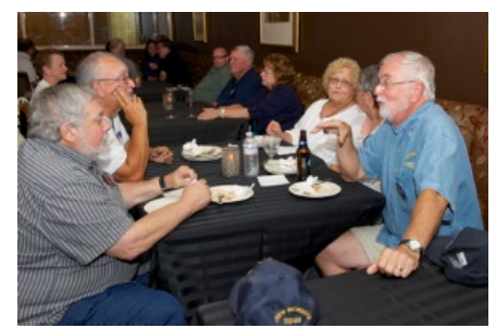
Catching up at the 2014 Reunion Reception

reconnecting with a couple of shipmates we hadn't seen since December, 1965. Wives also reconnected and established new and re-established old friendships formed at previous reunions.