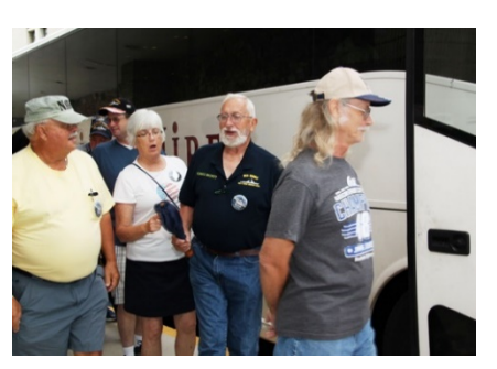
Boarding the tour bus