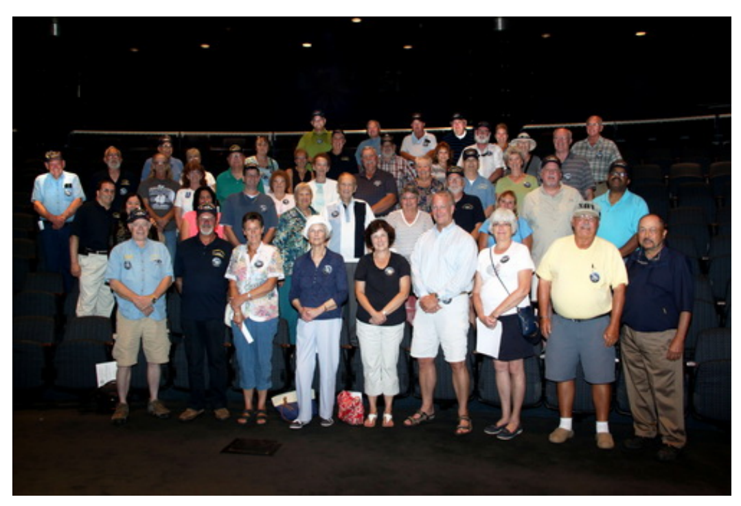
Plaque Dedication group shot