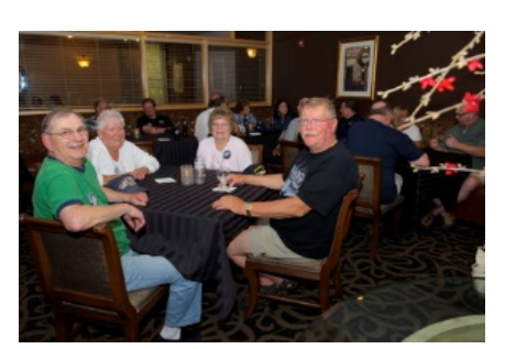
Catching up at the 2014 Reunion Reception

Saturday morning all hands gathered for the 2014 Crew Meeting. Donuts and coffee were available for early attendees, which were greatly appreciated after the previous evening's reception.