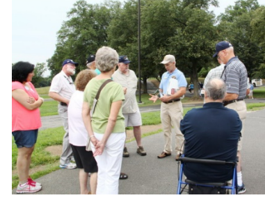
Talking with the volunteer