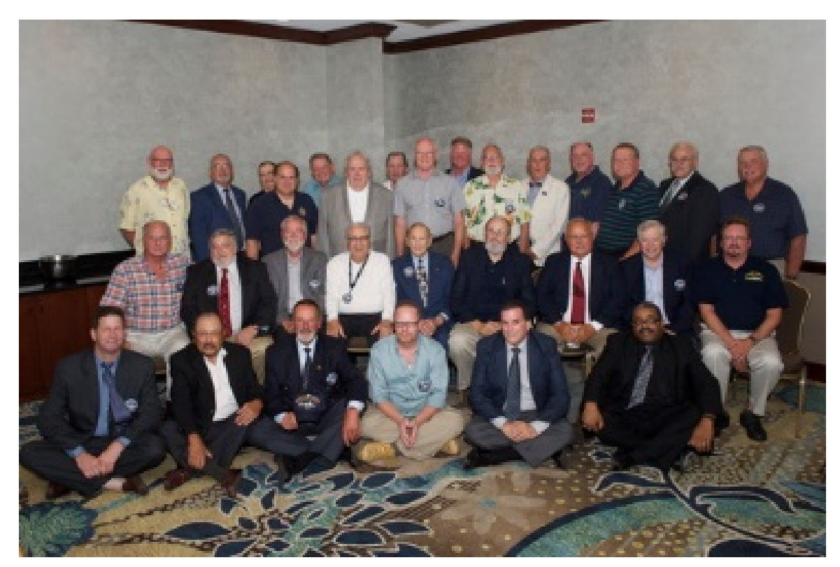
The 2014 Reunion DDG-5 Ship's Crew