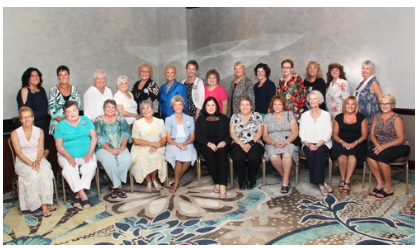
2014 Reunion Wives/SOs of the DDG-5 Crew

After dinner we gathered in the Hospitality Room to continue to share sea stories and gossip.