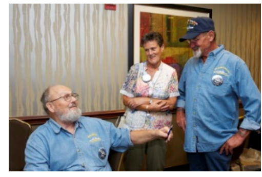
MMD (6/64 - 12/65) shipmates reconnecting

As usual, during the registration and check-in, shipmates re-connected with each other, caught up with our lives since the last reunion, told sea stores, met shipmates who hadn't attended previous reunion, and in this case for those of us who were on board during the MMD,