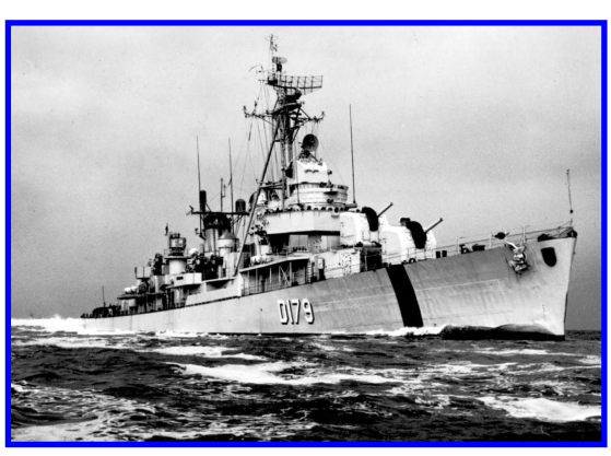
Federal German Navy—D179 Zerstorer 5 The former USS Dyson DD572

These are some photos of the various ships he was assigned to or sailed with after his graduation and thirty years of service to the Federal German Navy.