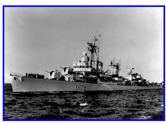
Federal German Navy—D172 Zerstorer 3 The former USS Wadsworth DD516