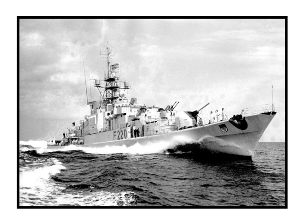
Koln—F220, type 124 Sachsen Class Frigate