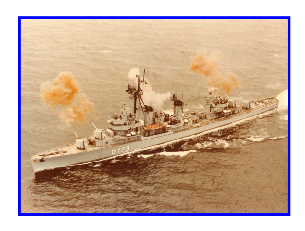
Zerstorer 5 D179 (Z5) At gunnery practice