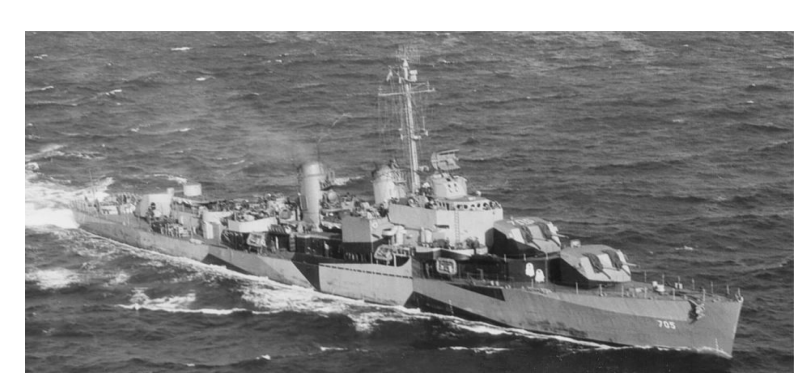
Commissioned November 4 1944 Decommissioned—September 27 1972