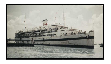
USS Solace—AH5 2nd Commissioned Hospital Ship