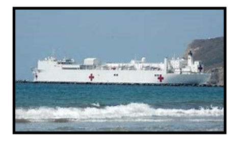
USS Mercy AH5 Active Duty—San Diego

Hospital ships can be traced back to ancient times. The Athenian Navy had a ship named the "Therapia" and the Roman Navy The "Aesculapius". Interpretation of both of these names translate into some form of medical aid and indicate they were hospital ships. The British listing of a ship assigned a medical or hospital ship is the HMS Goodwill. It is listed as accompanying a British squadron in the Mediterranean Sea 1609 and housing the sick.