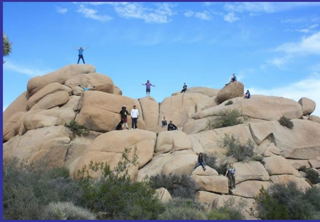
Joshua Tree Camping Trip

Christmas Party December 15 6:30 pm At the Sciutto's Bring White Elephant Gift (under $10)