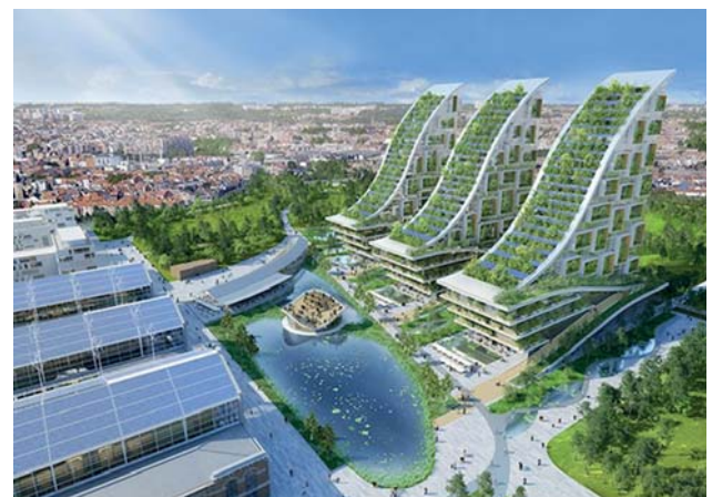
The ideal urban liveable city image: clean water, soil & air with minimal energy consumption.

Moreover, river base clean up and sponge city concept can be included as Dutch expertise which can be provided by this consortium too.