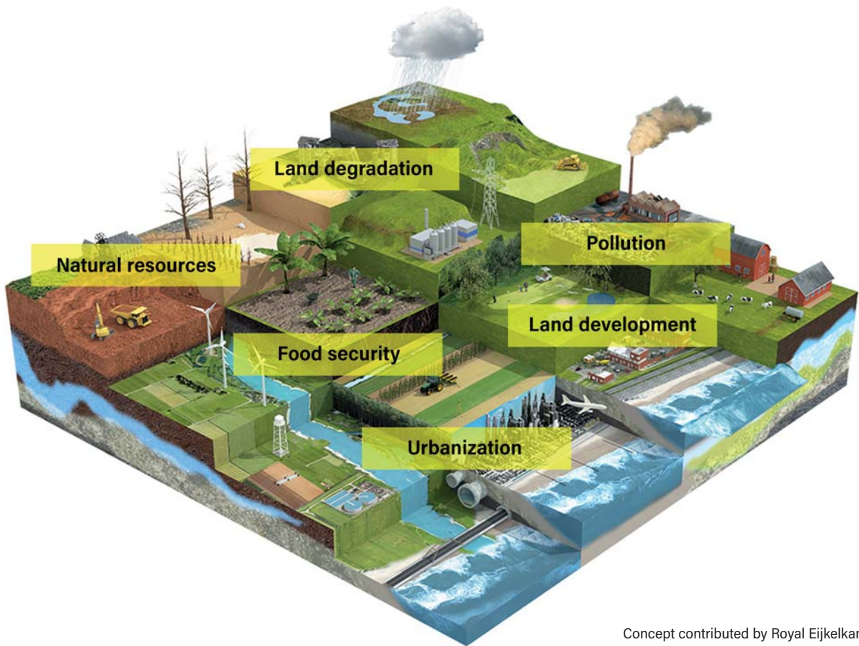
Concept contributed by Royal Eijkelkamp

The Chinese government usually reserve budget to cooperate with Dutch companies/ research institutes to either carry out projects or trainings, due to the existing sister and working relationships