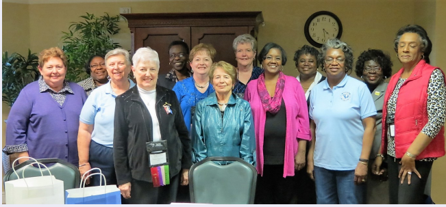
2016-17 SCAEOP-R Board