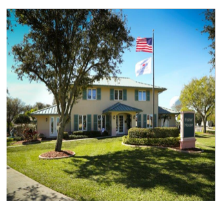
West Palm Beach VA Fisher House