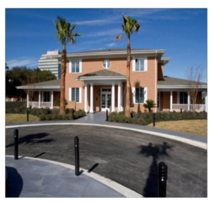
South Texas VA Fisher House