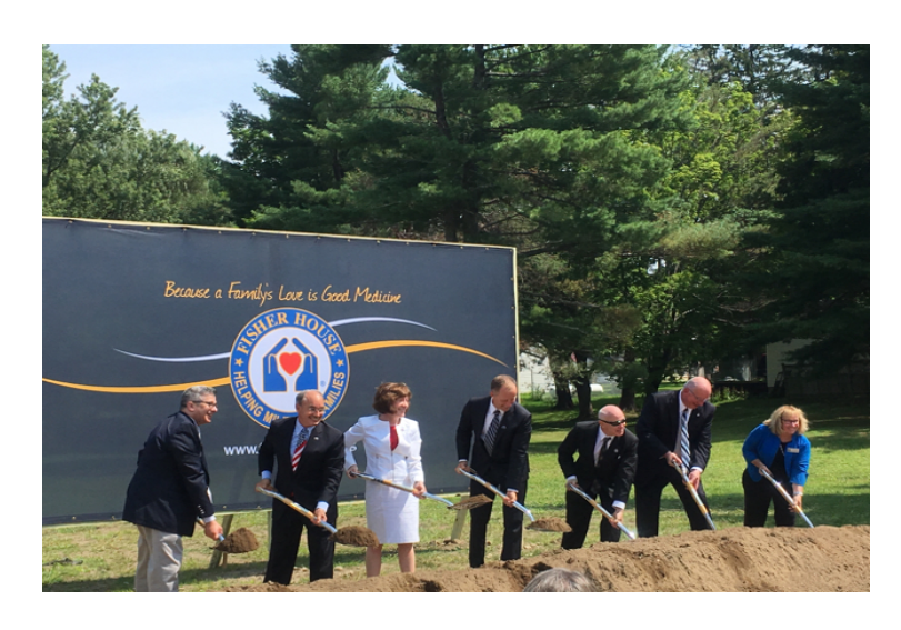
VA Maine HCS Groundbreaking