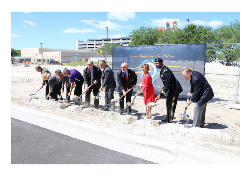
Tampa II Groundbreaking