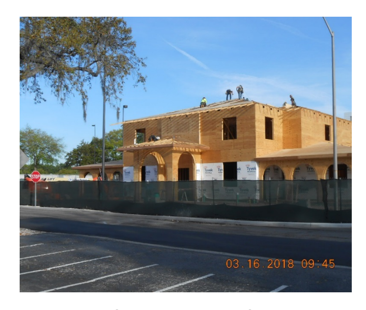
Tampa VAMC Fisher House II Construction

Huntington VA Medical Center, Huntington, WV. New Mexico HCS, Albuquerque, NM.