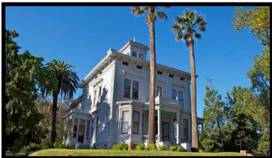
John Muir National Historic Site, Martinez, CA

Our program offers four PGY1 pharmacy residency positions. Two PGY1 residents are based at our Martinez, CA site and two PGY1 residents are based at our Sacramento, CA site. Applicants can choose to apply to the Sacramento based program, Martinez based program, or both programs. Although residents are primarily located in either Sacramento or Martinez, rotations are completed throughout the health care system. The VANCHCS is pictured above. PGY1 residents may rotate through clinics located at Mare Island, Martinez, Fairfield, Sacramento, and McClellan.