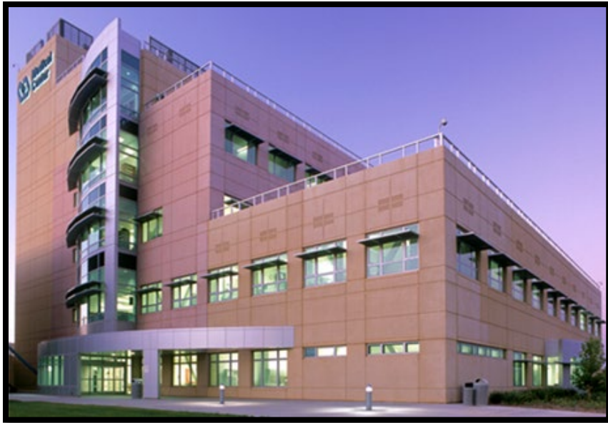
Sacramento VA Medical Center; Mather, CA