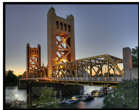
Tower Bridge, Sacramento, CA