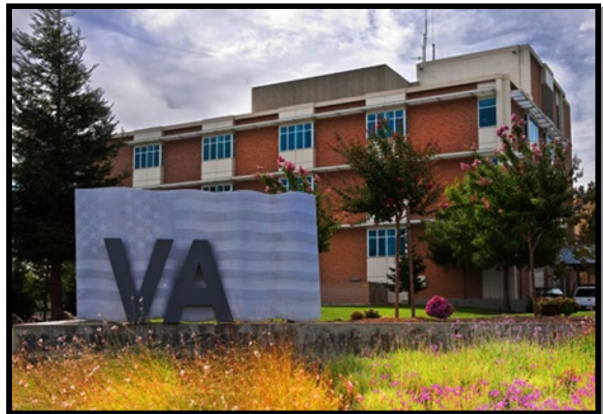
VA Martinez Outpatient Clinic; Martinez, CA