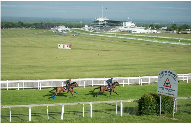
Cracksman & Pealer experience the Epsom contours | Racing Post