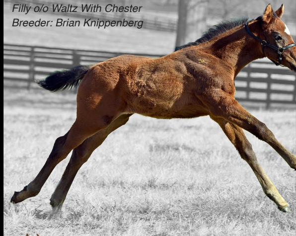
Filly o/o Waltz With Chester Breeder: Brian Knippenberg