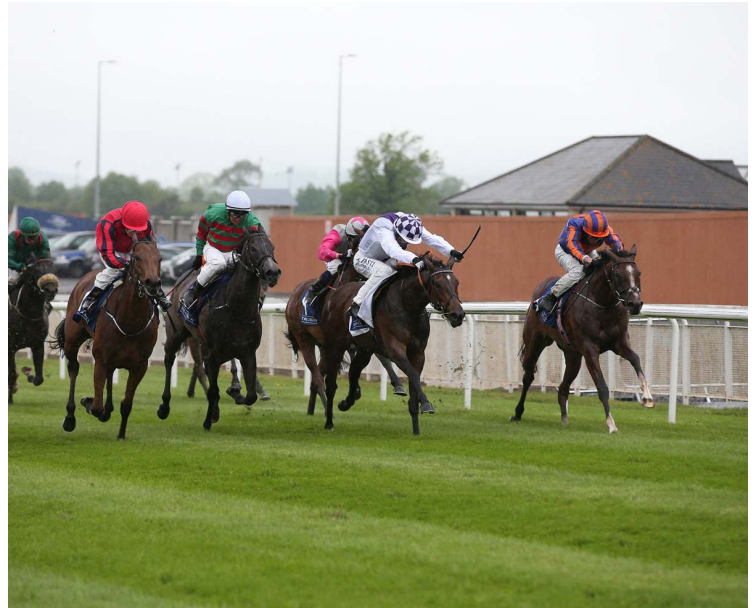
Clemmie (farside) finishing third at The Curragh