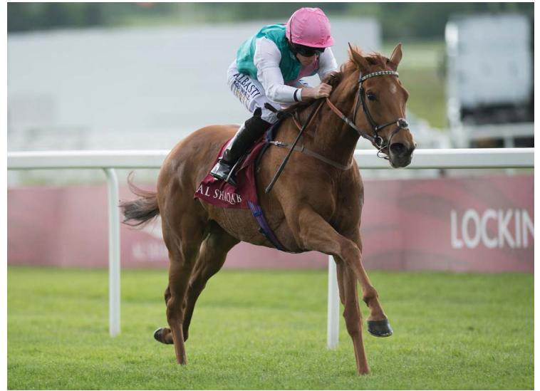
Nativia stretches clear | Racing Post