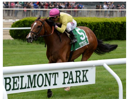
Fourstar Crook

prolonged seven-race win streak that continued in this Memorial Day event. The bay bagged the state-bred restricted Yaddo S. at Saratoga and John Hettinger S. at Belmont last year and was sent to the sidelines