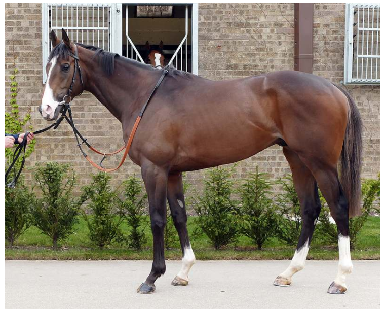
Escobar pictured at Hugo Palmer's stables last month | Emma Berry