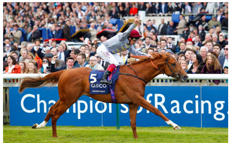
Galileo Gold | Al Shaqab Racing