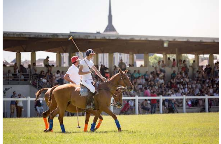
Polo during the first retrained racehorse day of 2017 held by Au-Dela Des Pistes