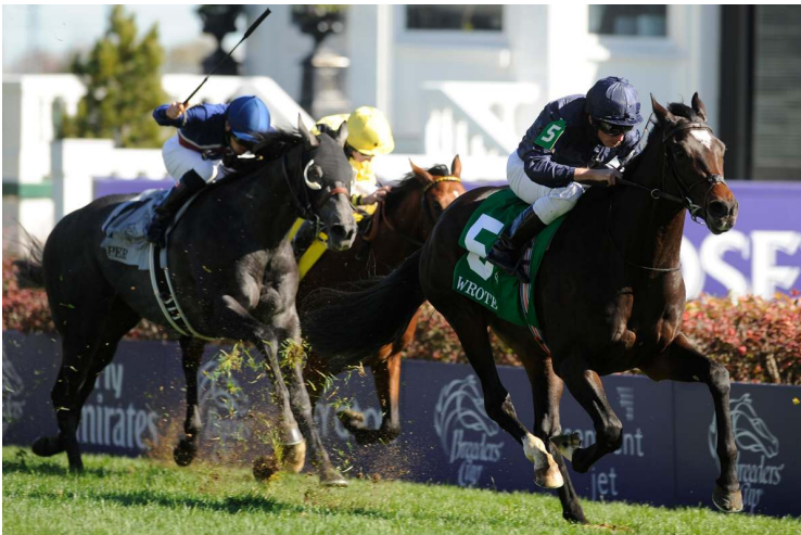
Wrote winning the Breeders' Cup Juvenile Turf | Racing Post