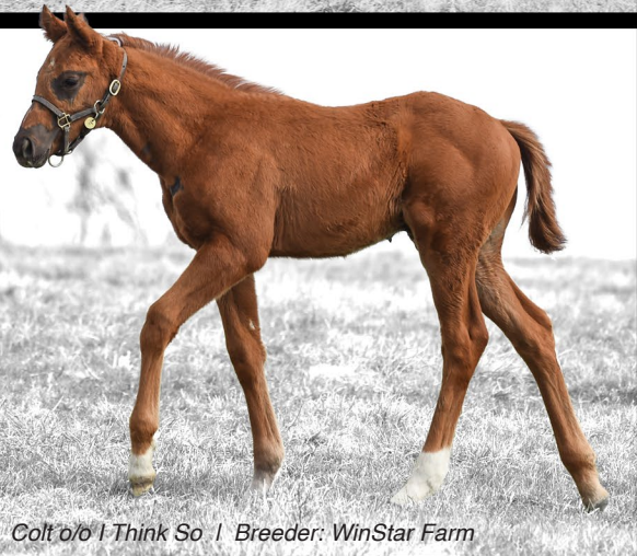
Colt o/o I Think So | Breeder: WinStar Farm