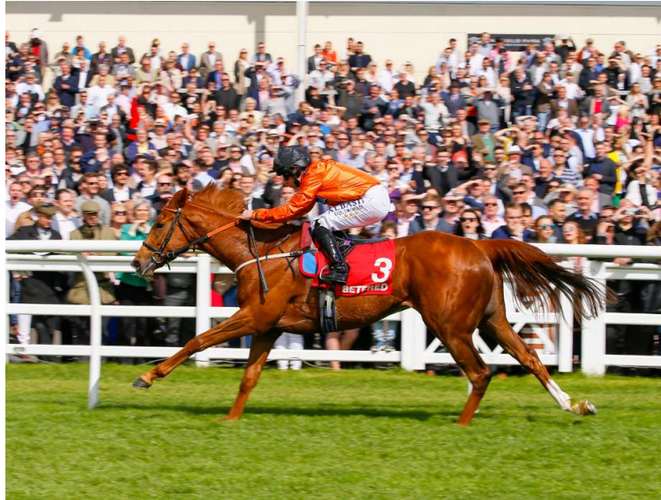
Mix And Mingle | Racing Post

(Exceed And Excel {Aus}), is a reminder that so often good things come to those who wait. It may be a worn cliché, but when it comes to racehorses, it's a saying worth bearing in mind.