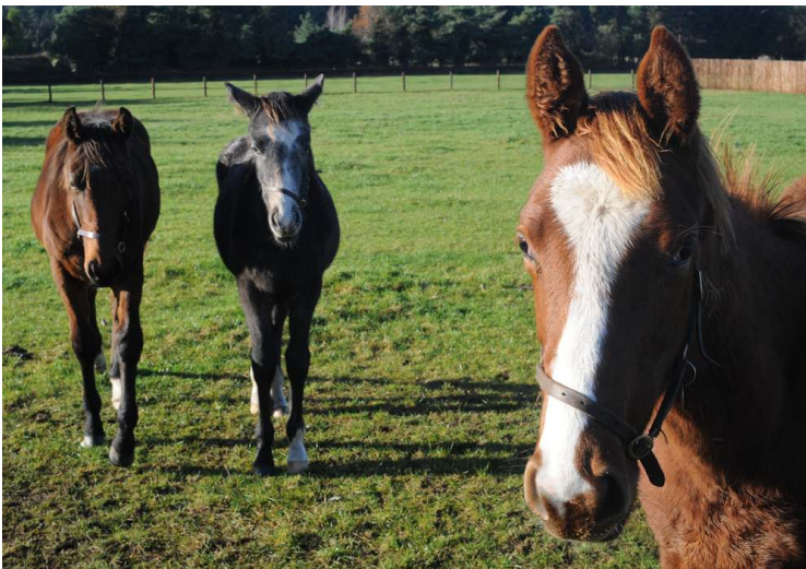
Decorated Knight (r) as a weanling