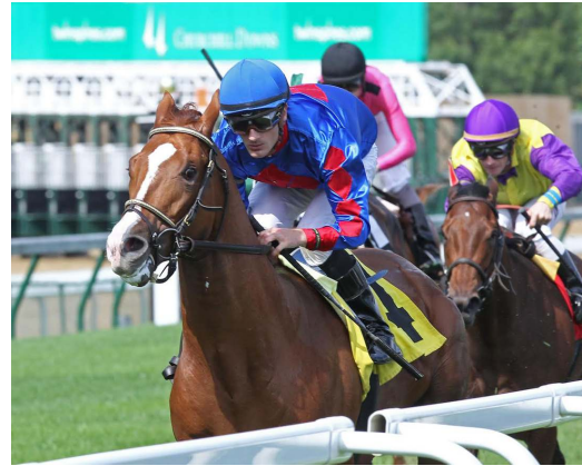
Sonic Boom

9th-CD, $50,010, Alw, 5-29, (NW3L), 3yo, 1mT, 1:36.11, fm. SONIC BOOM (c, 3, More Than Ready--Silent Circle, by Indian Charlie) graduated over the Kentucky Downs turf last September and placed in Santa Anita's Zuma Beach S. going a mile Oct. 10. He closed out his 2-year-old season with a third-place finish in a one-mile optional claimer on dirt here Nov. 10.