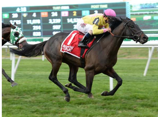
Offering Plan | Chelsea Durand

Offering Plan flashed considerable talent from day one and became a stakes winner with a score in the English Channel S. at Belmont in October 2015. Fifth in the GI Hollywood Derby to