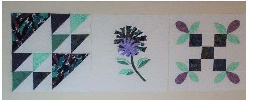
Nancy Hannum – BOW WOW Blocks