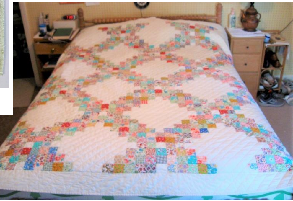
Ethel Hutchinson – Double Irish Chain