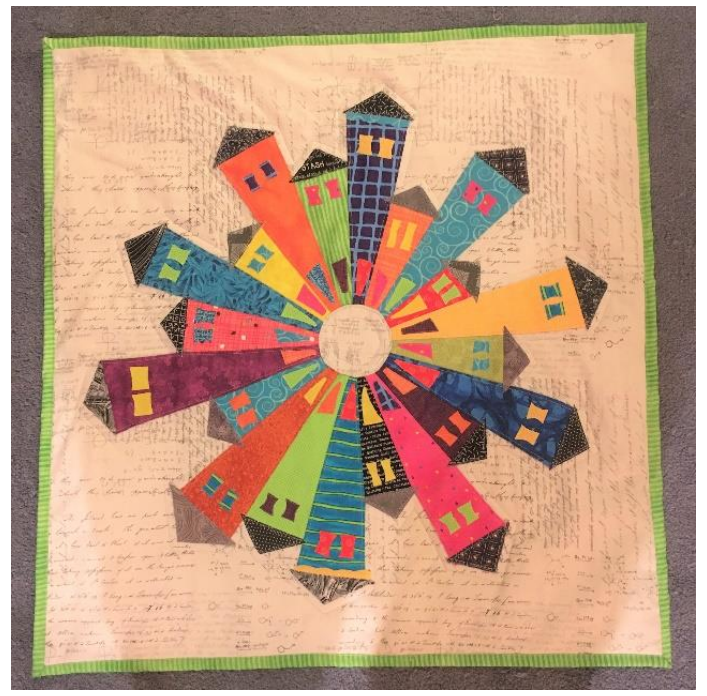
Ruth Heslin - Dresden Village Workshop