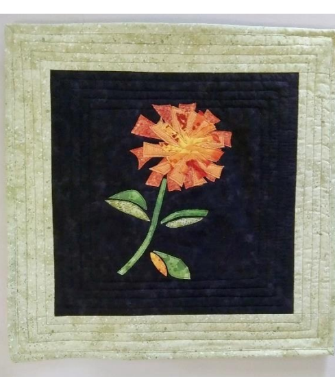
Kate Sevensky – BOW WOW Firecracker block