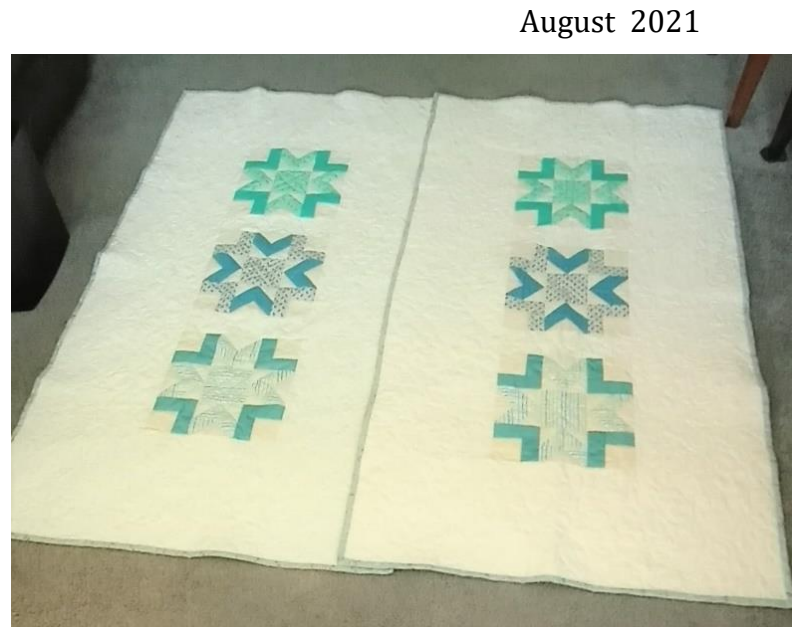
Linda Jarosz – Window Coverings