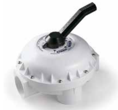
HiFlow Valve 261049