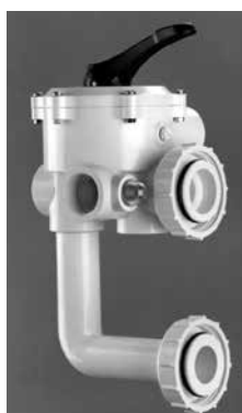
Multiport Valve Kit 261055