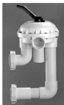
HiFlow Valve Kit 261050