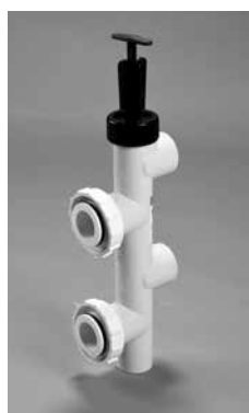
PVC Slide Valve Kit 263064