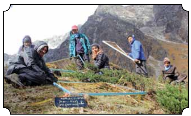
retrieved temperature monitors and resurveyed vegetation at the four elevationally-graded summits that were established in 2009 (in Langtang and Mei Li Shui) and 2010 (in Kangchenjunga), assessed dynamics of ethnobotanical traditions in the closest villages, and provided trainings to the young graduate students on GLORIA protocol and resampling methods.