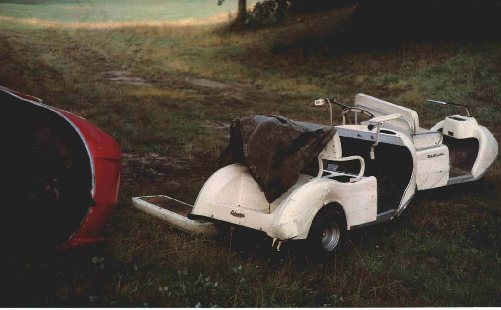
(Above) Thousands of dollars in damage each year to stolen golf carts.

(Below) Now you see him - now you don't.