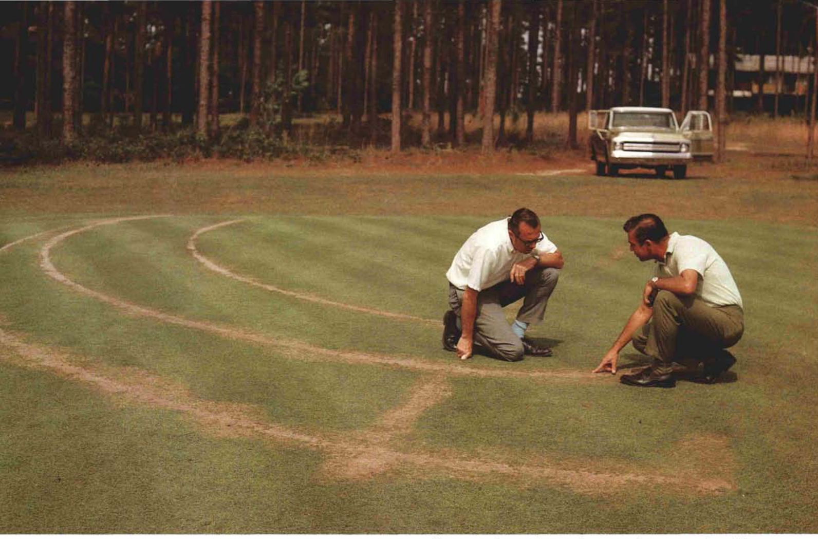
Greens are damaged more than any other area on the golf course.