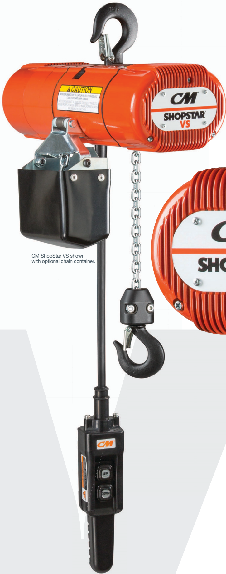
CM ShopStar VS shown with optional chain container.