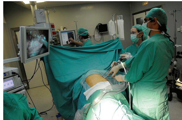
FIGURE 2: Surgeons in front of the patient.

Another potential advantage of the single port-approach could be a reduction in postoperative pain. There could be several explanations for this issue: only one intercostal space is involved and avoiding the use of a trocar could minimize the risk of intercostal nerve injury (during instrumentation, we try to apply the force over the superior aspect of the inferior rib through the utility incision). We have observed that patients operated by conventional VATS sometimes refer their pain towards the posterior and inferior incision and only a few times refer pain in the utility incision. We strongly believe that this pain could be explained by trocar compression over the intercostal nerve during camera movement. Some authors have reported less postoperative pain and fewer paresthesias in patients operated on for pneumothorax through a single incision, in comparison to the classical triple-port approach [36, 37]. Further studies will be required to demonstrate that there is less pain with