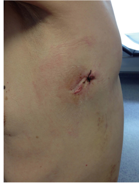
FIGURE 1: Postoperative result of single incision.

Even though the field of vision is only obtained through the anterior access site, the movement of the camera alongside the incision as well as its rotation will create different angles of vision (30 degree camera recommended to achieve a panoramic view). The advantage of using the camera in coordination with the instruments is that the vision is directed to the target tissue, bringing the instruments to address the target lesion from a straight perspective, thus we can obtain similar angle of view as for open surgery. Conventional three-port triangulation makes a forward motion of VATS camera to the vanishing point. This triangulation creates a new optical plane with genesis of dihedral or torsional angle that is not favorable with standard two-dimension monitors. Instruments inserted parallel to the videothoracoscope also mimic inside the chest maneuvers performed during open surgery. There is a physical and mathematical demonstration about better geometry obtained for instrumentation and view in the uniportal VATS over conventional approach.