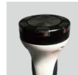
40K ULTRASONIC + RF