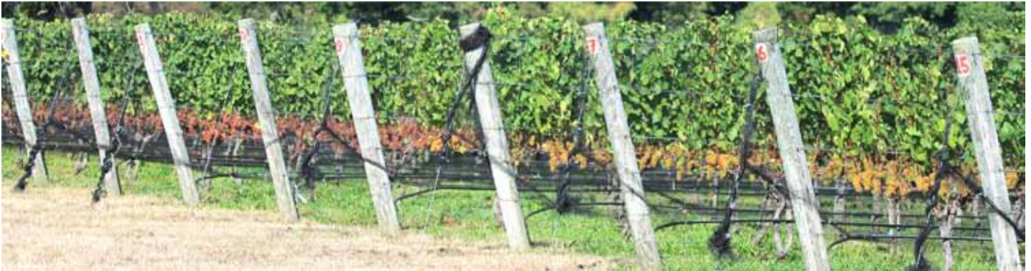
September 22. Gewurztraminer (l) and Chardonnay (r) at One Woman Wines on the North Fork of Long Island.