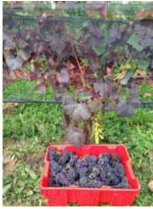
Fruit from Zweigelt vines symptomatic of virus infection was significantly lower in color and Brix than asymptomatic vines.