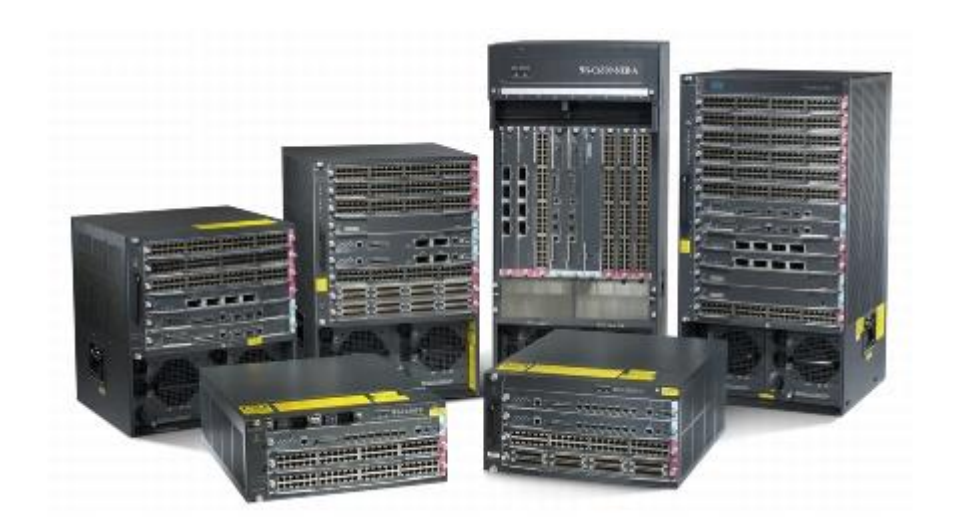
Figure 2: Cisco Catalyst 6500-E Series Chassis