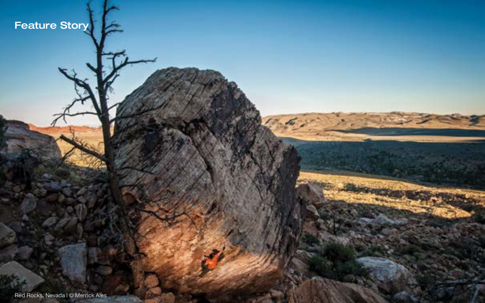
Red Rocks, Nevada