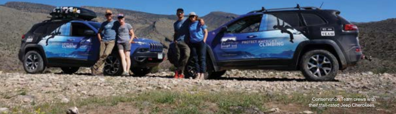
Conservation Team crews with their trail-rated Jeep Cherokees.

What's better than one Access Fund–Jeep Conservation Team traveling the country to care for our climbing areas? Two teams! In 2011, we sent the first mobile Access Fund–Jeep Conservation Team out on the road to help local communities build more sustainable climbing areas that can withstand the impact of increasing climber traffic.