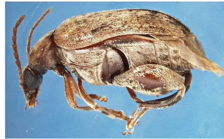
Fig: Adult & Larva of C. serratus

11.1 Phytosanitary certificates shall be issued as per model format prescribed under the IPPC with an additional declarations as per requirements of the importing country;