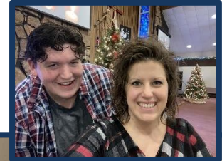
SOUNDS OF THE SEASON