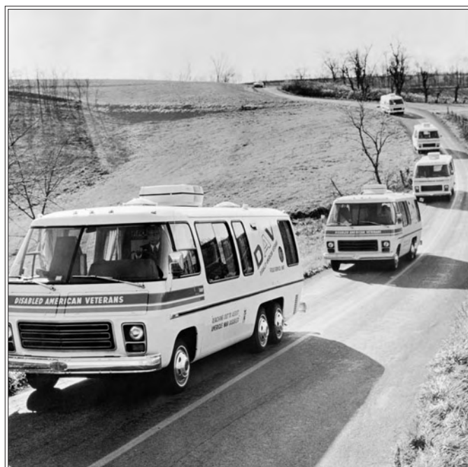
FIELD SERVICE UNITS ON THE ROAD

SOON THE FSU FLEET WAS INCREASED TO 18 VANS. OVER A 19-YEAR PERIOD, THEY BROUGHT THE DAV'S SERVICE TO 608,000 VETERANS AND MEMBERS OF THEIR FAMILIES BEFORE THE PROGRAM WAS RETIRED IN 1993.