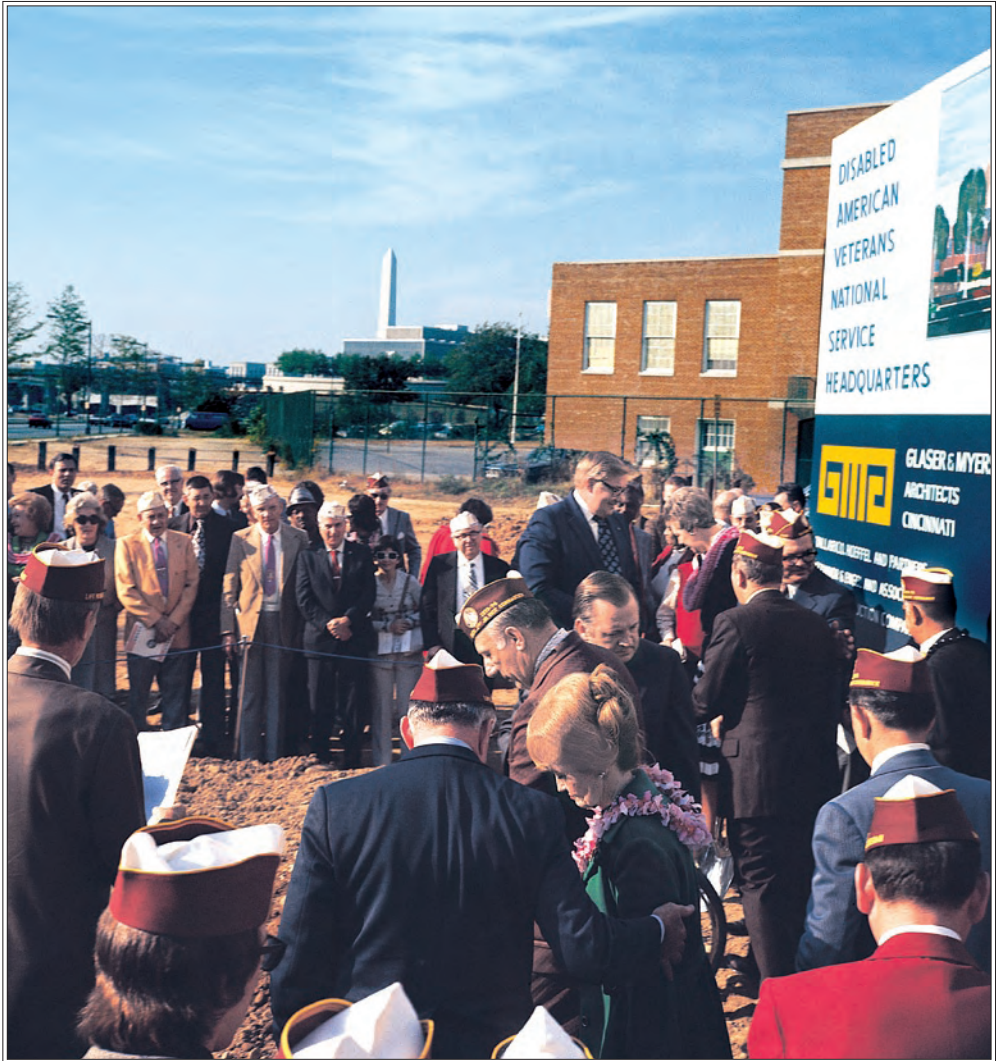
GROUND BREAKING FOR THE NATIONAL SERVICE AND LEGISLATIVE HEADQUARTERS, 1973

Soon the FSU fleet was increased to 18 vans. Over a 19-year period, they brought the DAV's service to 608,000 veterans and members of their families before the program was retired in 1993.