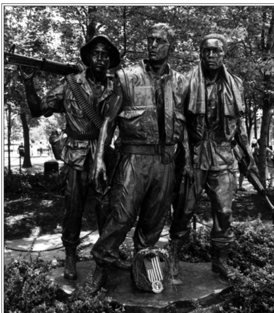
"THE THREE SOLDIERS" STATUES BY FREDERICK HART AT THE VIETNAM VETERANS MEMORIAL IN WASHINGTON, D.C.

BY MARCH 1979, THE DAV HAD REACHED A NEW MILESTONE OF 600,000 MEMBERS. HAVING ACHIEVED THIS FIGURE, DAV STRENGTH WAS IMPRESSIVE BY ANY STANDARD. OF THE 2.2 MILLION DISABLED VETERANS ELIGIBLE FOR MEMBERSHIP, MORE THAN ONE-FOURTH WERE DAV MEMBERS.