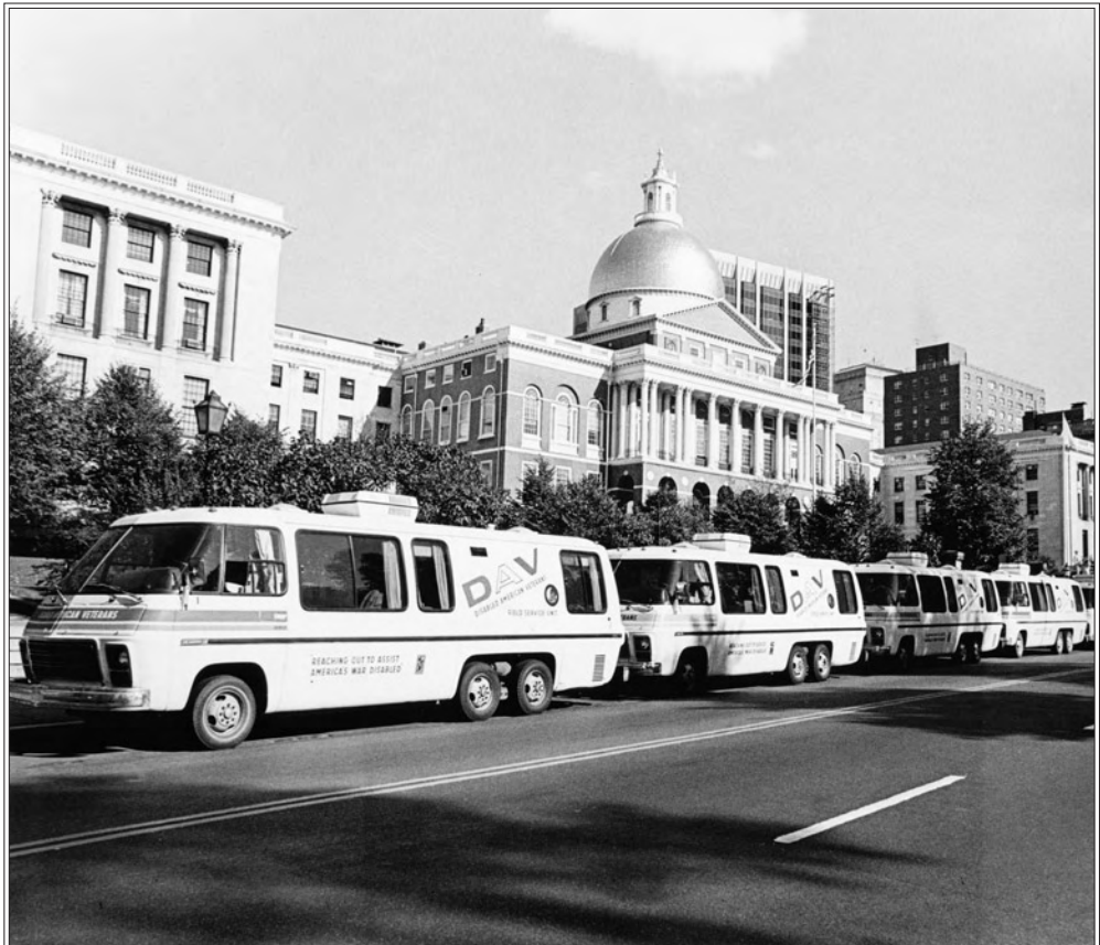
FIELD SERVICE UNITS AT THE STATE HOUSE, BOSTON, MASSACHUSETTS

In August 1971, the organization ended its year-long anniversary celebration at the Detroit Hilton Hotel. In a coincidence of numbers, the actual site of the DAV's first National Convention was only 50 yards away.