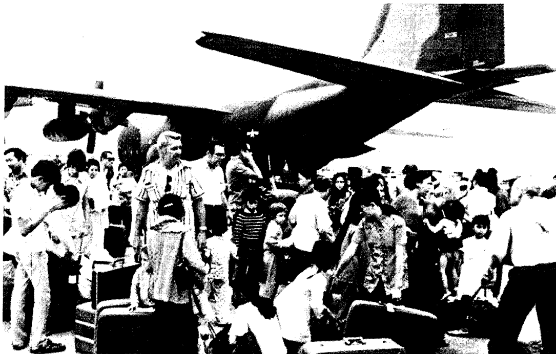
Americans and Vietnamese deplane from a C-130 after evacuation from Vietnam.

Initially, most evacuees flew to Clark AB in the Philippines, but on April 23, Philippine President Ferdinand Marcos an-