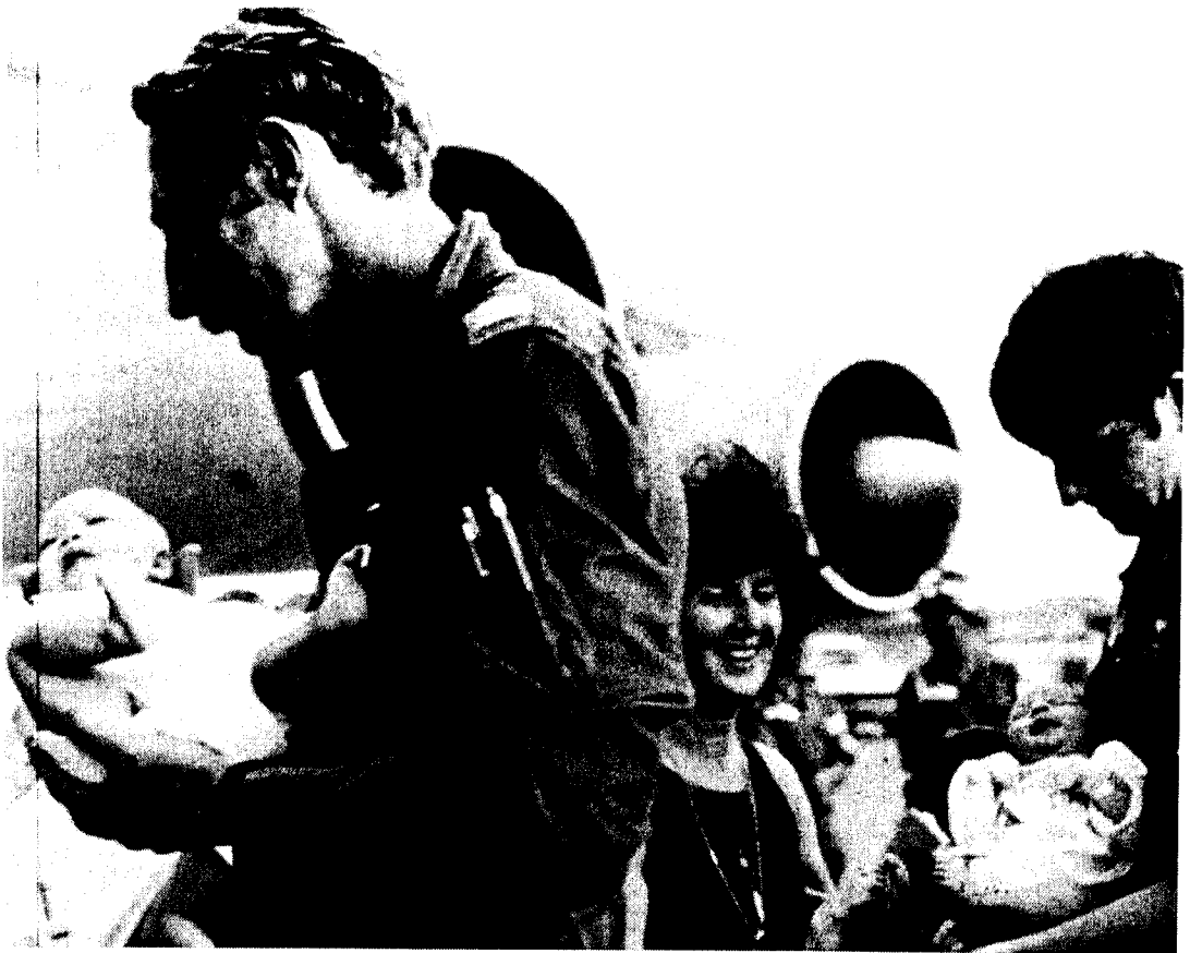
MAC crew members cradle South Vietnamese infants during Operation BABYLIFT.

Other airplanes, including military transports and commercial airliners under contract, eventually evacuated more than 2,600 Vietnamese orphans to Hawaii and on to the continental United States.