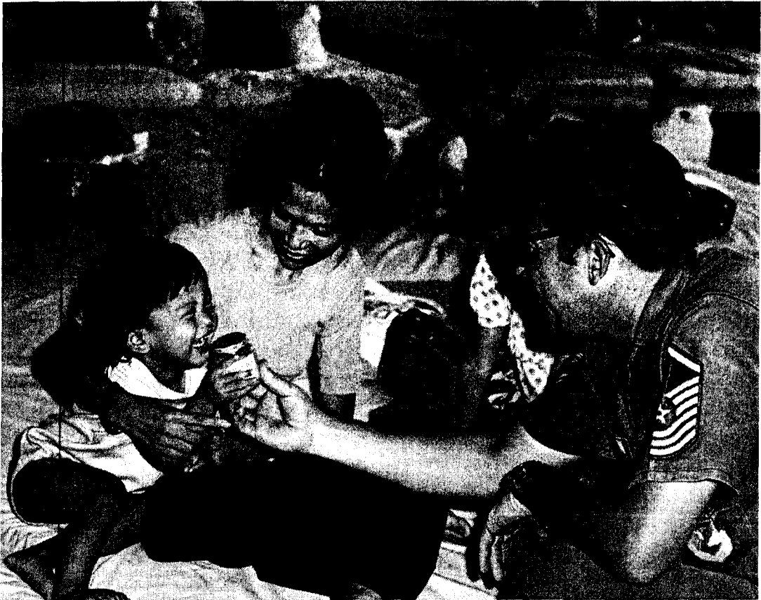
A USAF NCO gives food to a Vietnamese refugee family in Guam.