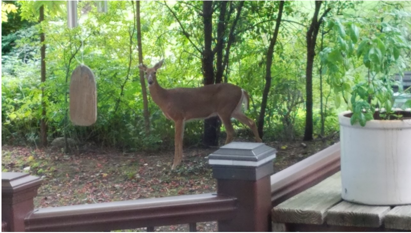
A friend stopped by at dinner time the other night.