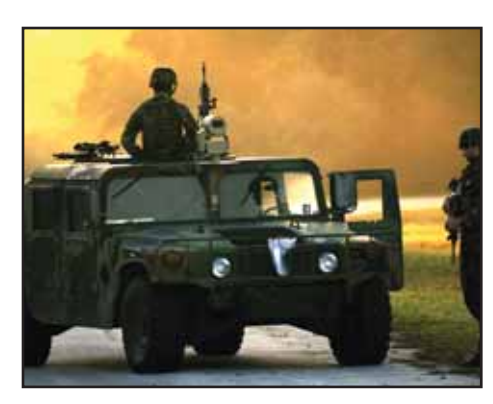
Military, Federal and State Government

Honeywell is focused on providing complete security solutions for your mission-critical site. The Vindicator Radar Detection System ties three areas of perimeter security together to help you detect objects and people at distances up to several kilometers. When it comes to managing and integrating your radar detection system, Vindicator provides adaptable solutions for critically important and high-risk sites.