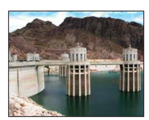
Ports and Critical Infrastructure