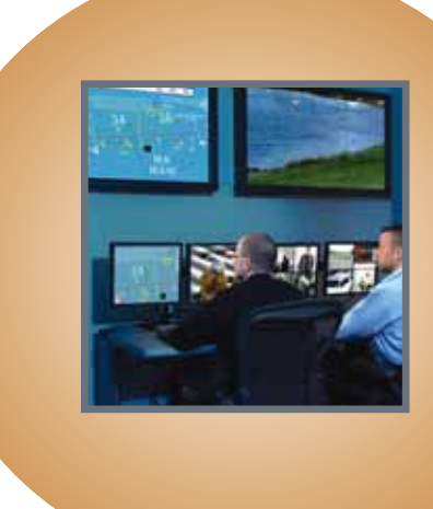
Command & Control Platform