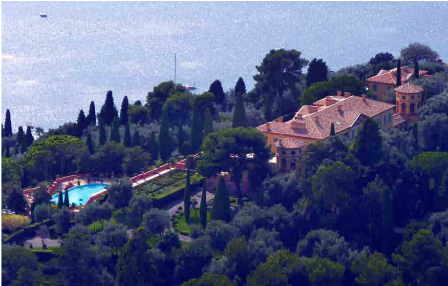
King Leopold's estate on the French Riviera was just 10 miles from the property later purchased by Mobutu Sese Seko in Cap Ferrat.