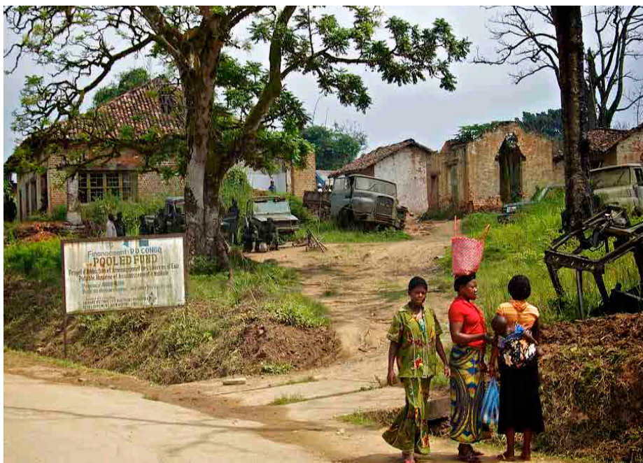
FARDC local headquarters, Walikale. While top commanders do well for themselves, the pay and conditions for most Congolese soldiers are poor, which encourages pillage.

Mobutu, unwilling and incapable of developing a genuine administration, encouraged a system in which the Congolese turned on each other for survival. In Michael Schatzberg’s apt terms, “extraction, exploitation, and oppression” became pervasive, as all “Zairians in positions of authority [used] their parcels of power to extract what they [could] from those in contextually inferior positions,” leading to a “society where corruption, dishonesty, and inhumanity have become all too common.” 209 The subsequent Sovereign National Conference (1992-94), Inter-Congolese Dialogue (2001-03) and Transition (2003-2006) meant to right the course of the Congolese state, to lay new foundation from which Mobutu’s “anti-values” would be banned. Yet, contrary to the hopes laid on it by the Congolese, the Kabila administration has reverted to Mobutuism, and Congo has largely regressed to Zaire.