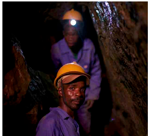
Life for Congolese artisanal gold miners is still very difficult, but there have been improvements in the artisanal tantalum, tin, and tungsten sector, as 79% of those miners now work in conflict-free mines thanks to reforms and a certification process.

on cooperatives, traders (negociants), and exporters (entités de traitement). 188 In the Kasai provinces, artisanal miners from diggers to traders are responsible for almost all of the country’s diamond output since the collapse of the industrial diamond mining parastatal MIBA around 2006. Diggers sell their diamonds to traders (previously comptoirs, now entités de traitement) and thereby enter the formal economy. In the east, however, where artisanal miners are mainly engaged in gold mining, but also in tin, tungsten, and tantalum (the 3Ts), a large portion of their production is smuggled out of the country or leaks into the informal economy. However, this has changed for the 3Ts, thanks to global mineral reforms, U.S. legislation, the regional ICGLR certification process, and the iTSCi minerals process. Artisanal gold production alone is estimated at about 8 to 12 tons a year. 189 Using data from multiple sources, the value of artisanal mining is estimated at about $1.4