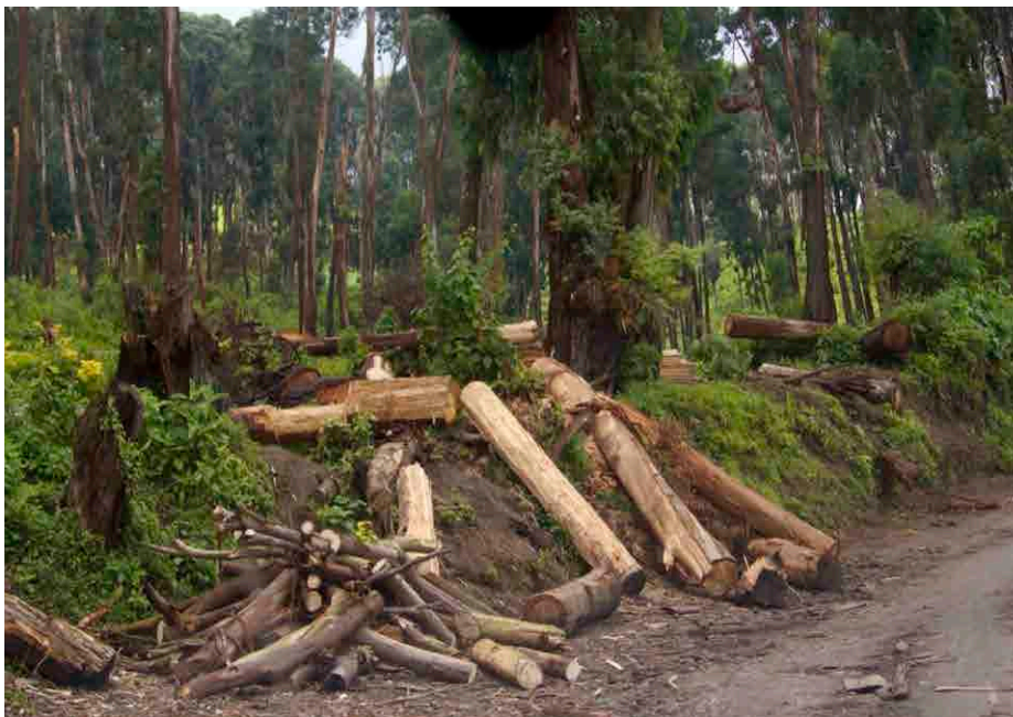
Virunga National Park: The FDLR and Congolese army and police units collaborate to chop down trees in the park and make and sell charcoal. The trade is worth as high as $32 million per year, according to a UN report.

The U.N. Group of Experts has reported year after year that armed groups and army units have profited from the minerals trade, 147 and as far back as 2001 the