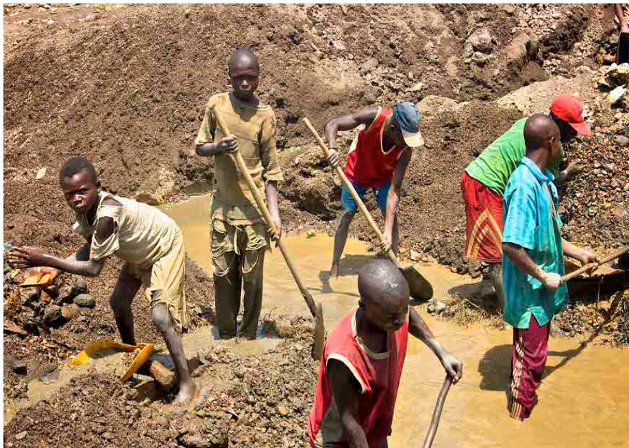
A gold mine in Walungu, South Kivu. Artisanal miners are routinely harassed by the army, unpaid government officials, and armed groups, and gold mines in particular have many child miners.