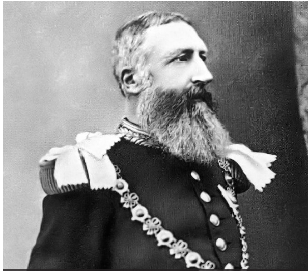
The first violent kleptocrat in Congo, King Leopold II. Between 5 and 10 million people were killed during his reign, while he stole an estimated $1.1 billion.