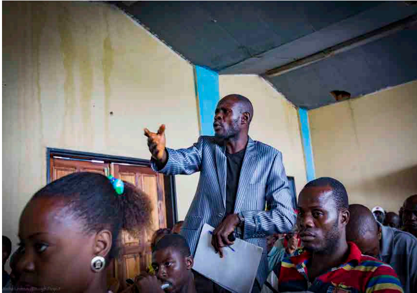
A Congolese citizen at a community meeting held by the electoral commission CENI. Citizens across Congo have been troubled by the fact that elections will not be held on time and that CENI has been underfunded.