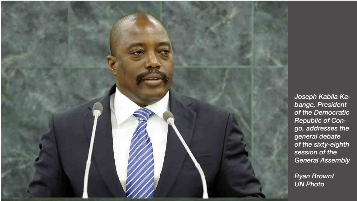
Joseph Kabila Kambange, President of the Democratic Republic of Congo, addresses the general debate of the sixty-eighth session of the General Assembly