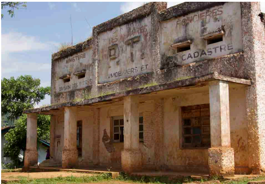
A government office in South Kivu. The hijacked state means that government services suffer greatly.

to selected local leaders and communities in order to reduce opposition to the state while simultaneously deepening competition between communities in order to prevent the emergence of a united local opposition." 20 This helps fuel conflict, as the military benefits from insecurity and lawlessness in maximizing profits, and local populations form defense militias in response. For example, United Nations experts estimated that $400 million worth of gold mainly from the conflict-affected east was smuggled out of Congo in 2013, benefiting abusive commanders, officials, and collaborators in neighboring countries. 21