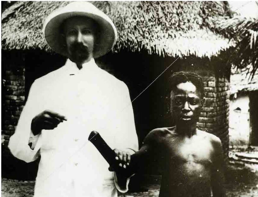
The system of violent kleptocracy began under King Leopold II of Belgium. Here a colonial Belgian official documents to the king that no bullets were wasted in enforcing law and order.

service units, which perpetrated massacres against students and Christian demonstrators, imprisoned democratic activists, assassinated opposition leaders, and regularly looted civilian areas. 254 One of his units, the Special Action Forces, were known as the Owls because they perpetrated assaults mainly at night. 255 As journalist and foreign policy analyst Mvemba Dizolele writes, “The message of fear registered in the national psyche, and the show of force terrified people into submissiveness.” 256 Mobutu also used army units, militias, and other security organs to foment local disorder and prevent rising political opposition.