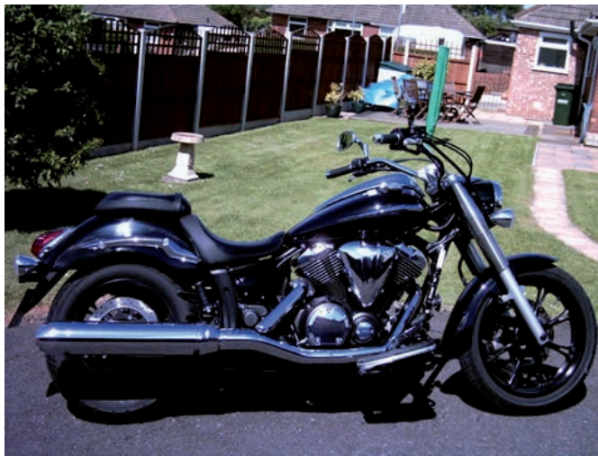
Yamaha's new XVS 950cc Midnight Star cruiser