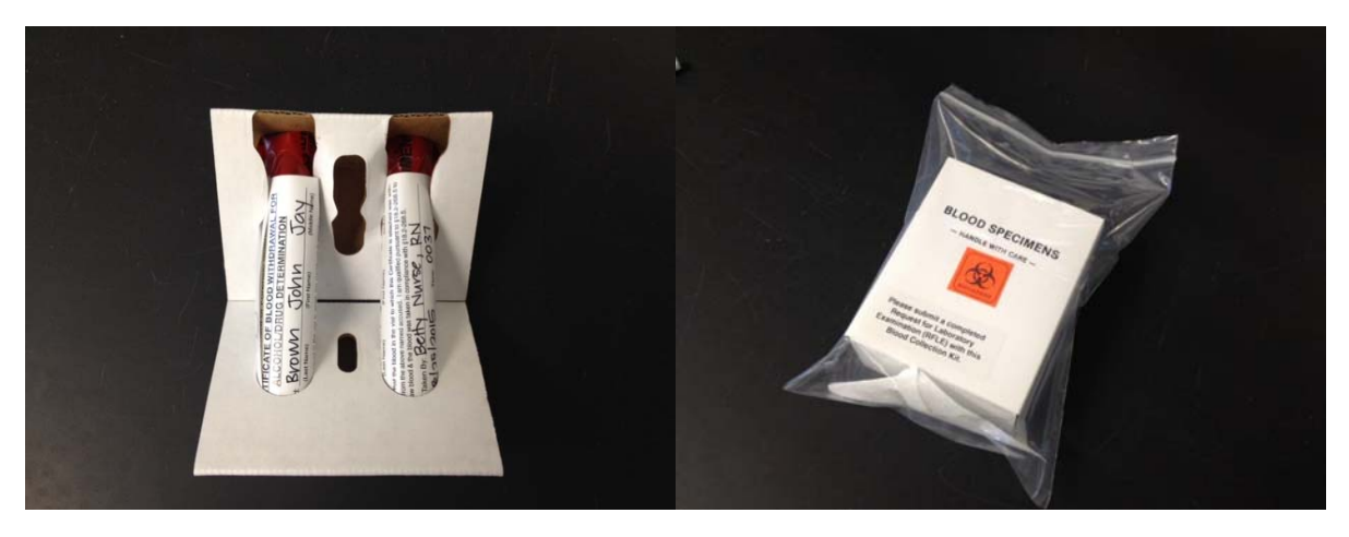
Figure 5: Completed blood vials in specimen holder.