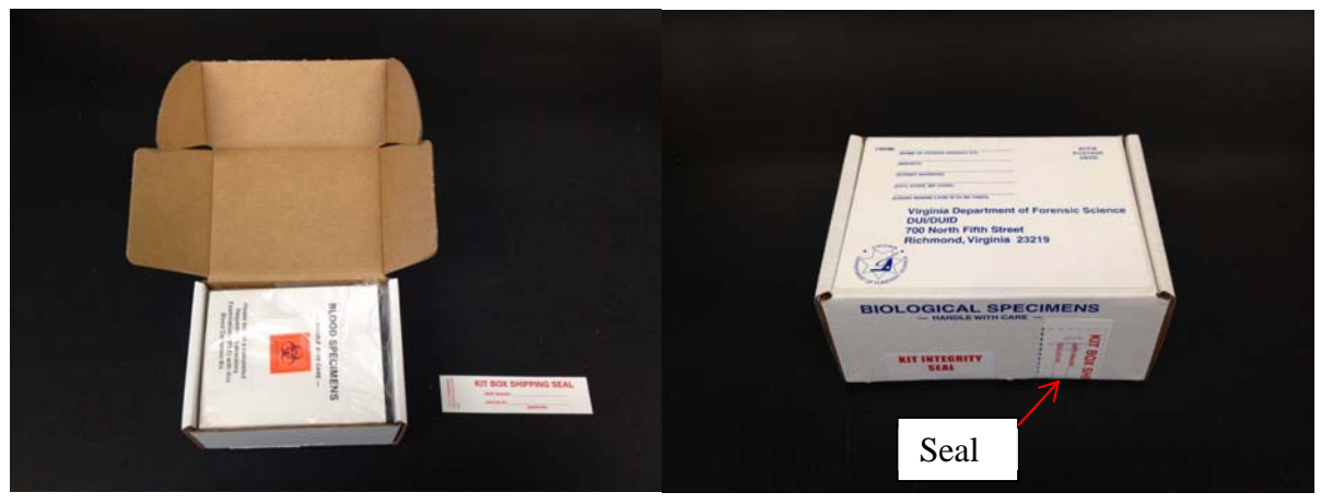
Figure 7: Bag with specimens placed into outer container.