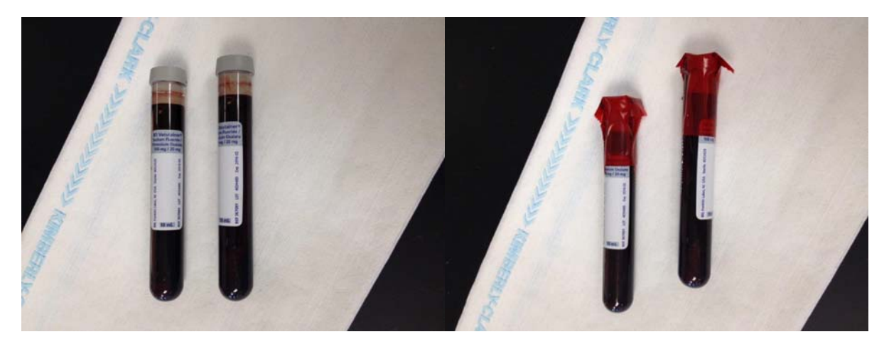
Figure 1: Gray top blood vials filled with blood.

The vials shall be sealed by the person taking the sample, or at his/her direction. (Figure 2) The person who seals the vials shall complete the pre-numbered Certificate of Blood Withdrawal forms (CBW) and attach one CBW to each vial. (Figures 3 and 4) The vials shall be placed in a container provided by DFS and the container shall be sealed to prevent tampering with the vials (§18.2-268.6). (Figures 5, 6, 7, and 8) Promptly transport or mail the DUI container to the designated laboratory address indicated on the mailing box. If the accused is known to have a blood borne disease (HIV/AIDS, Hepatitis B, etc.) the kit must be hand delivered to DFS.