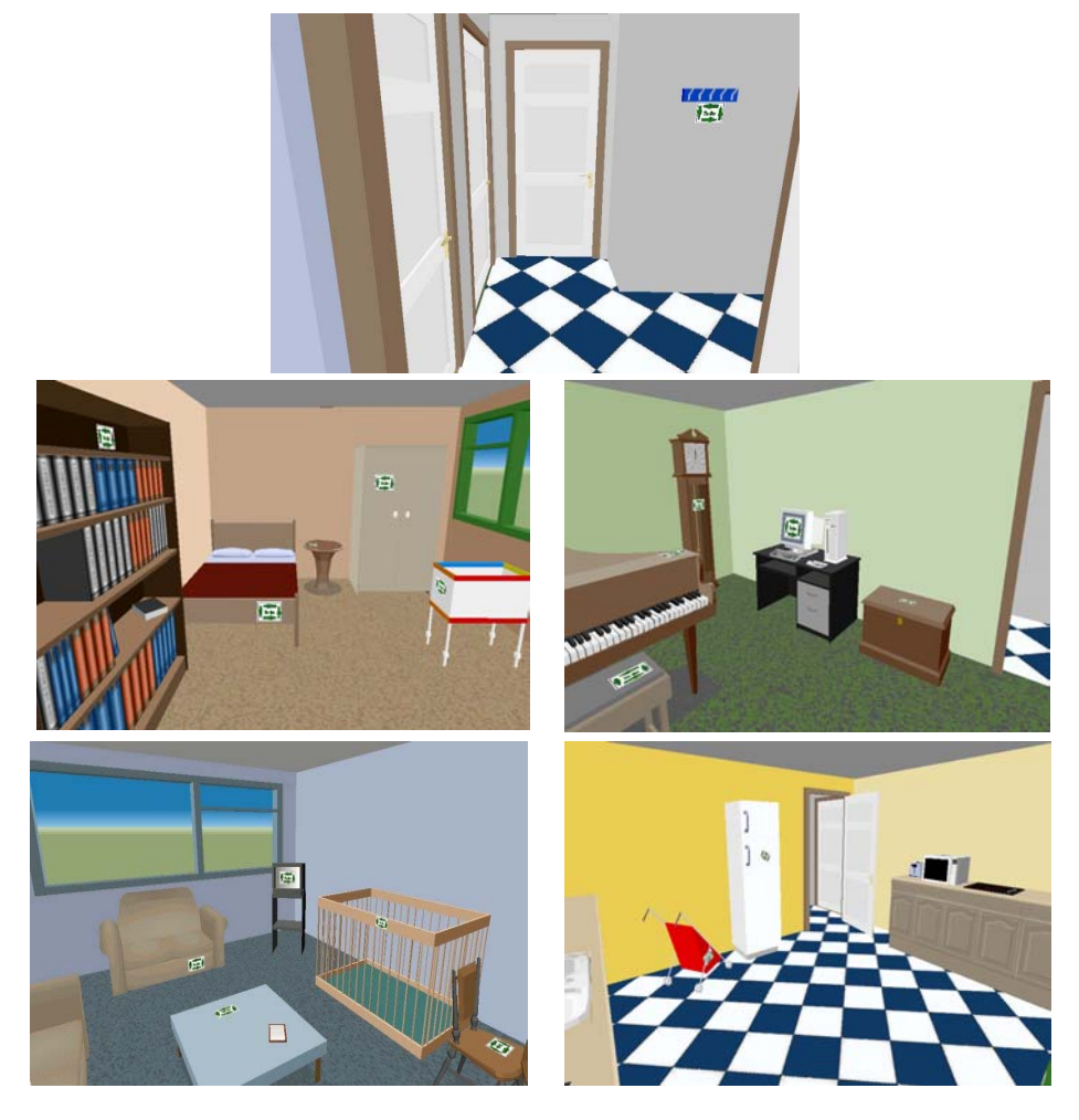
Figure 1. The Bungalow Task showing hallway (top) and four rooms (bottom four panels).