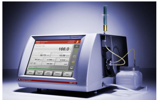
Figure 1: SVM™ 3001

The samples were measured with the SVM™ 3001 viscometer. The instrument features a viscosity and a density measuring cell, which are filled in one go.