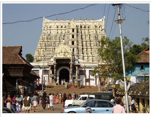
The front-wide of the Ananthapadmanabhaswamy Temple, which is a Lord Vishnu Temple, depicting Him in His Universal "Padmanabha" form, and is considered the wealthiest Temple in the world, with assets estimated potentially to be in terms of trillions of dollars.

On a magnificent cot having a thousand heads spread out, worshipped and praised by many, in an islet surrounded by Kaveri with bellowing waves, is the lying posture of the one who has Lakshmi sitting in his chest