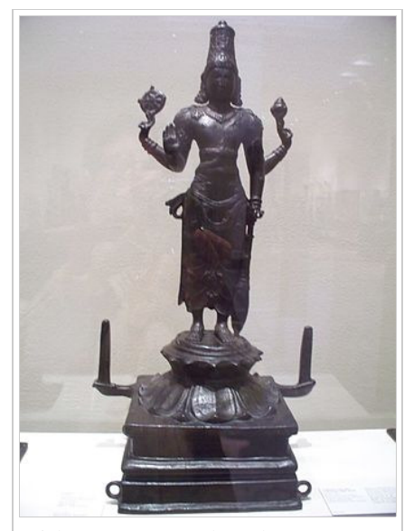
Vishnu Bronze, 10th-11th century, Coimbatore, Tamil Nadu, India

Though such solar aspects have been associated with Vishnu by tradition as well as modern-scholarship, he was not just the representation of the sun, as he moves both vertically and horizontally.