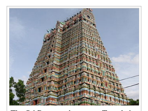
The Sri Ranganathaswamy Temple is a Hindu temple dedicated to Vishnu located in Srirangam, Tiruchirapalli, Tamil Nadu, India. Srirangam temple is often listed as the largest functioning Hindu temple in the world, the still larger Angkor Wat being the largest existing temple. [36][37] The temple occupies an area of 156 acres (631,000 m²) with a perimeter of 4,116m (10,710 feet) making it the largest temple in India and one of the largest religious complexes in the world. [38]

Other important qualities attributed to Vishnu are Gambhirya (inestimatable grandeur), Audarya (generosity), and Karunya (compassion). Natya Shastra lists Vishnu as the presiding deity of the Sṛngara rasa.