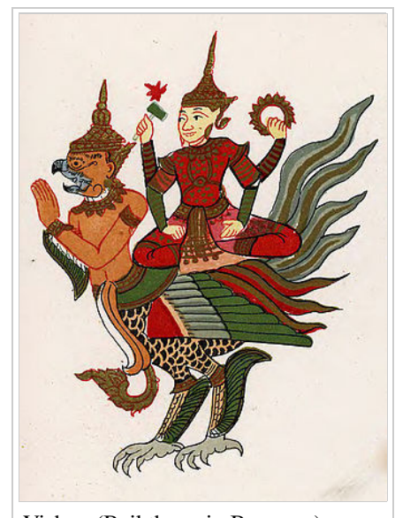
Vishnu (Beikthano in Burmese) on his mount, the garuda, in the traditional Burmese depiction.