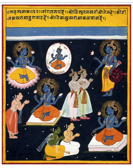
Vishnu sahasranama manuscript