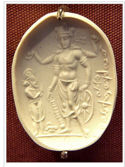
A 4th–6th century CE Sardonyx seal representing Vishnu with a worshipper. The inscription in cursive Bactrian reads: "Mihira, Vishnu (right) and Shiva".

Indra has no option but to seek help from Vishnu. Indra prays before Vishnu for protection and the Supreme Lord obliges him by taking avatars and generating himself on Earth in various forms, first as a water-dweller (Matsya, fish), then as an amphibious creature (Kurma avatar or Tortoise), then as a half-man-half-animal (Varaha the pig-faced, human-bodied Lord, and Narasimha the Lord with lion's