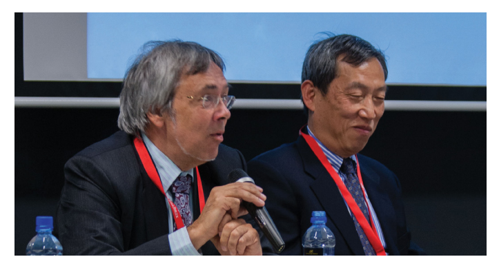
The Second Session panel.

Moving forward with Asia: Recognising the potential of Asia-savvy graduates and their value for NZ