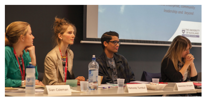
The Fourth Session panel.

Meaningful pursuits for the Asia-savvy: Social enterprise, community leadership and beyond