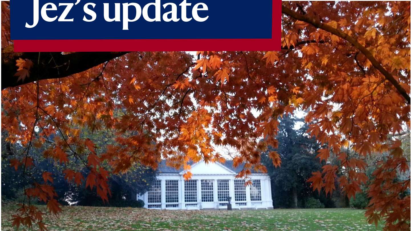
The Orangery in the Garden at Saltram.