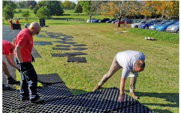
Saltram staff and volunteers lay metres and metres of temporary car park matting to prepare for the busy Christmas period.

The one way system is in place 24/7 and we would appreciate your co-operation with this for everyone's safety.