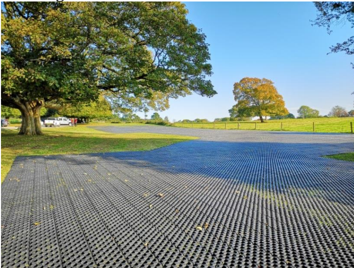
Temporary recycled plastic car park matting