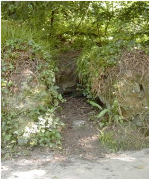
Saltram's grotto in need of restoration