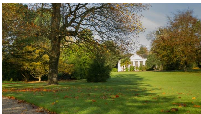
Saltram garden in autumn