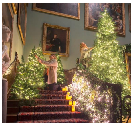
Staff and volunteers decorate the Staircase hall for Christmas