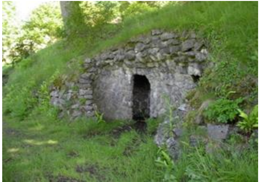
An example of what the grotto should look like

Many may not be aware but hidden in plain sight, right next to the riverside walk, covered in ivy with trees growing from it, with a collapsed roof, lies Saltram's grotto.