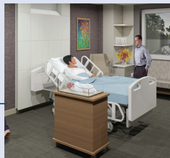
Dolores Kator Switzer Women's Center.