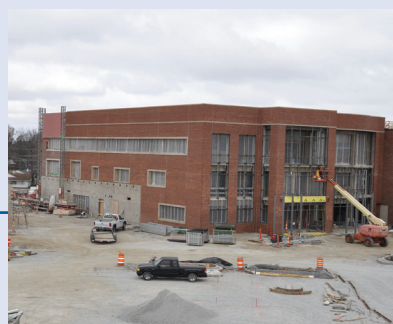
The three-floor expansion and renovation is opened, which includes a new Emergency Services, Senior Behavioral Health Unit and Sports Medicine & Rehabilitation Services.