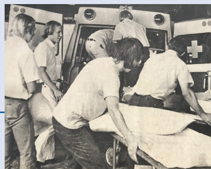
MDH is designated a trauma center with full-time physician coverage in the ER and ambulance services.