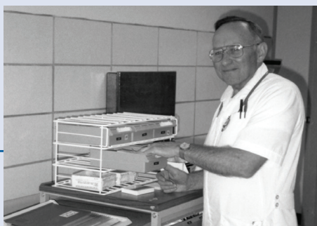
Transitional Care Unit opens.

For more information on the Dolores Kator Switzer Women's Center, or to donate to the project, log onto www.MDH.org or call the MDH Foundation Office at (309) 836-1757.