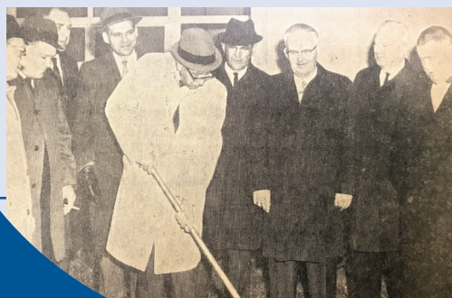
Addition on 2nd and 3rd floors set to begin including a new OB department and minor renovations to radiology, pharmacy and outpatient services.

For more information about the Hospitalist program, visit MDH.org .