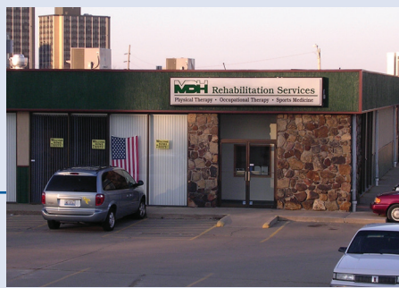
The Outpatient Rehab Facility on North Lafayette is opened and the Baby Talk program begins.