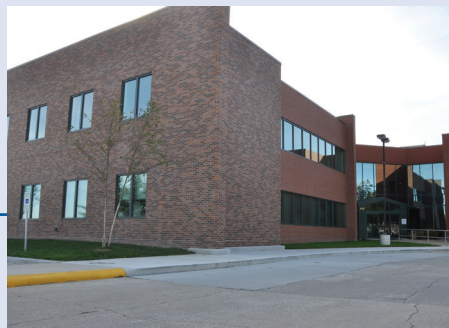
Health Services Building II is expanded to provide room for more MMG clinics.