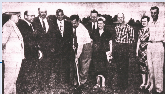
Hospital groundbreaking, June 30.