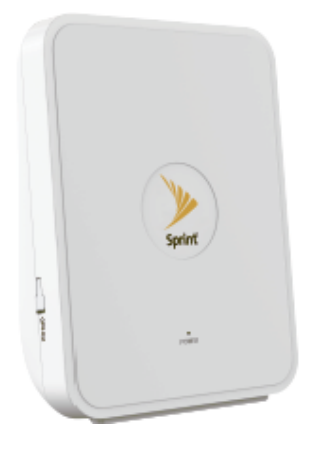
Figure 1: Sprint Voice Pro