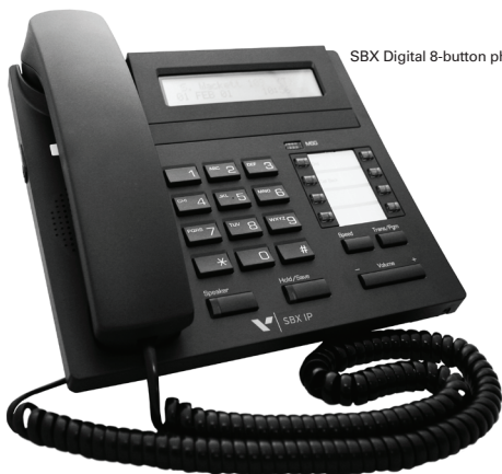
SBX Digital 8-button phone

It's easy to use, too. You empower employees to use its range of phone and voice mail features thanks to an easy navigation pad and LCD feature menus. Ultimately, the SBX IP lets you focus on running your business, not your telecom system.