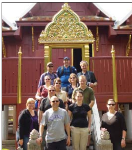
MAB group sightseeing in Bangkok.

Lumpur, Malaysia; C.P. Retails and Marketing (CPRAM), Chiameng Rice Mill and the United Nations in Bangkok, Thailand; Dabaco Feed Mill and local wet markets in Hanoi, Vietnam; and a Cargill feed mill and small-to-large size back-yard hog farms outside of Ho Chi Minh City, Vietnam.