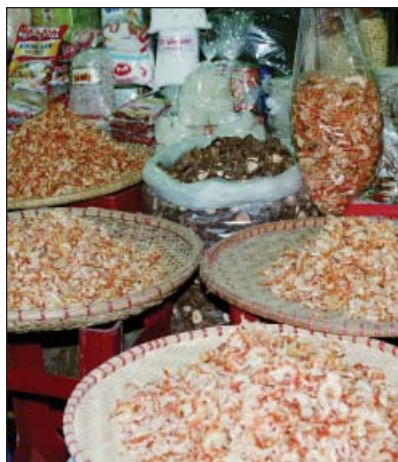
Dried shrimp & fish products at market in Vietnam.