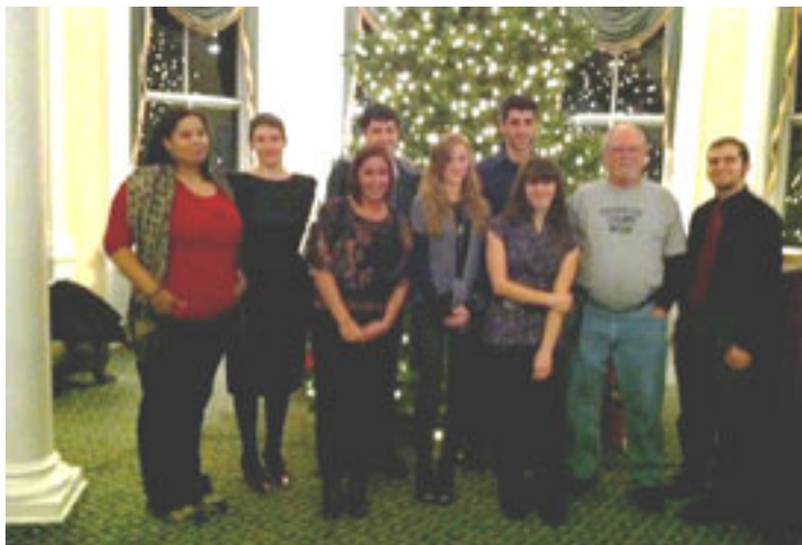
Writers on the Rise program