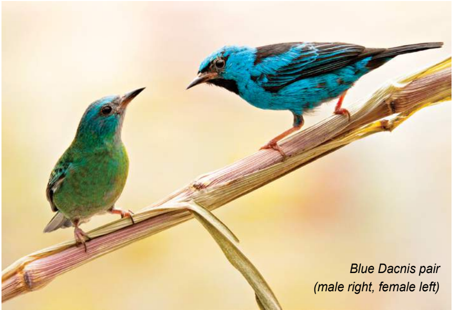
Blue Dacnis pair (male right, female left)

The Blue Dacnis ( Dacnis cayana ) is a beautiful, smart, and delightful species. Native to South America, they are in the family Thraupidae, which also includes tanagers and honey-creepers. Relatively small at 11 cm, they are one of the smallest Thraupidae.