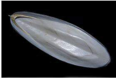
Top and bottom view of a cuttlebone, the buoyancy organ and internal shell of a cuttlefish

or powder form of cuttlebone is also available online, I provide it to my finches in a separate food dish and they eat it faster than I can fill the dish!