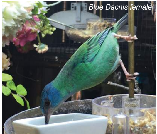
Blue Dacnis female

Their diet is varied—it sounds complicated, but it really is not. Daily fresh fruit is a must. These birds will get hypoglycemic and perish if not fed the proper diet. Favorites are papaya, oranges, pears, watermelon, cantaloupe, mango, and bananas, organic if possible. Insects are also a requirement. Here they get a constant supply of live mealworms and live wax worms every day. A “softbill” diet is provided; I get mine from Paradise Earth.