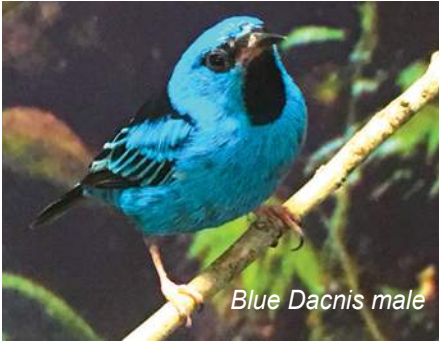
Blue Dacnis male

These birds have a delightful “twisp-twisp” sound, which you will hear first thing in the morning, and they are the last to roost for the night. They are often seen hanging upside-down from the top of the aviary and the natural tree branches provided for them. They are curious and not overly fearful of humans. They can be “tamed” to take food from, and land on, your hand.