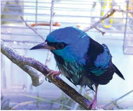
Blue Dacnis male wet after bath