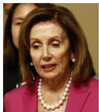
Nancy Pelosi

Despite a lobbying effort by Trump and party leaders for a unified GOP front, four Republicans voted to condemn his remarks: moderate Reps. Brian Fitzpatrick of Pennsylvania, Fred Upton of Michigan, Will Hurd of Texas and Susan Brooks of Indiana, who is retiring.