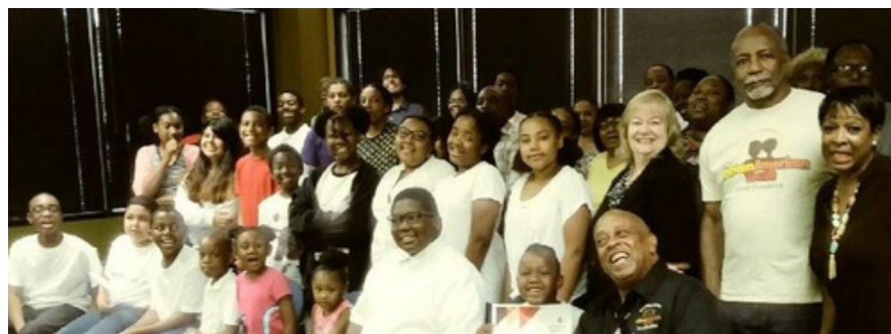
Photo of Urban University Participants, volunteers, and African American Youth Harvest Foundation staff, and sponsors.