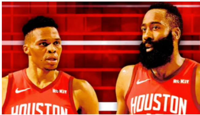
Old OKC teammates Westbrook and Harden to reunite in Houston. (Getty Images/Ringer illustration)