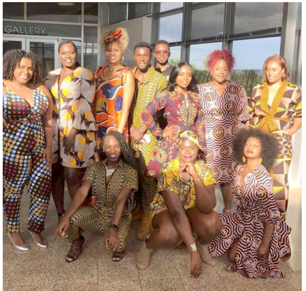
1st Annual African Summer Fashion Show.

by Tsoke (Chuch) Adjavon | VILLAGER Columnist