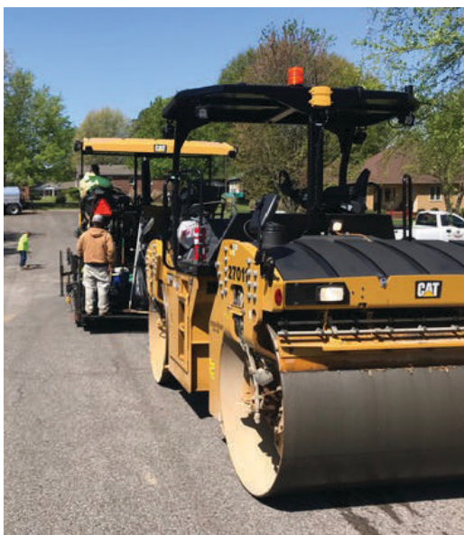
Jim Smith Contracting paving in Mayfield, KY.

In closing, we want to encourage everyone to be safe and attend the monthly District meetings held the first Tuesday of the month (except June and December) at 7:30 p.m. at the AFL-CIO Building in Paducah, KY. If our office can be of any assistance, please do not hesitate to call our office at (270) 443-7766. ♦