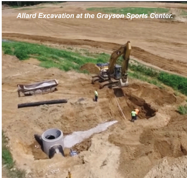
Allard Excavation at the Grayson Sports Center.