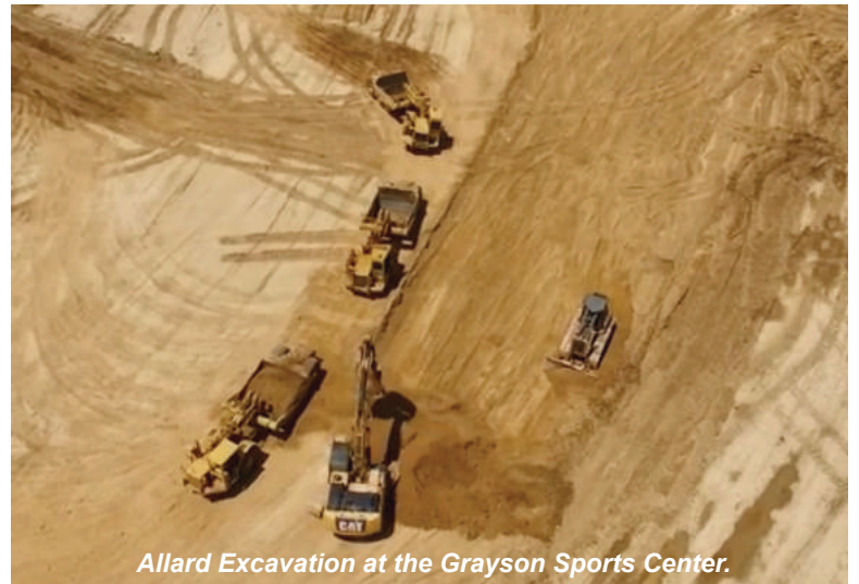
Allard Excavation at the Grayson Sports Center.