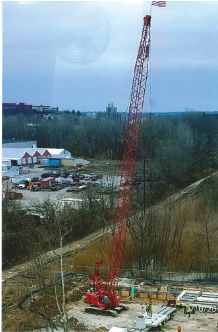
Kokosing on the Westside Treatment Plant expansion in Evansville, IN

At AEP Power Plant in Rockport we will have BMW, UCCI and Skanska working with them on the SCR project and the DSI project as well at that site. More operators should be added in the coming weeks. Skanska also has some small furnace rebuild jobs at Alcoa.