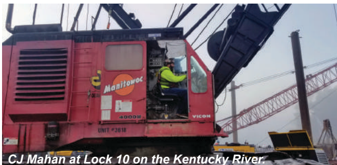
CJ Mahan at Lock 10 on the Kentucky River.