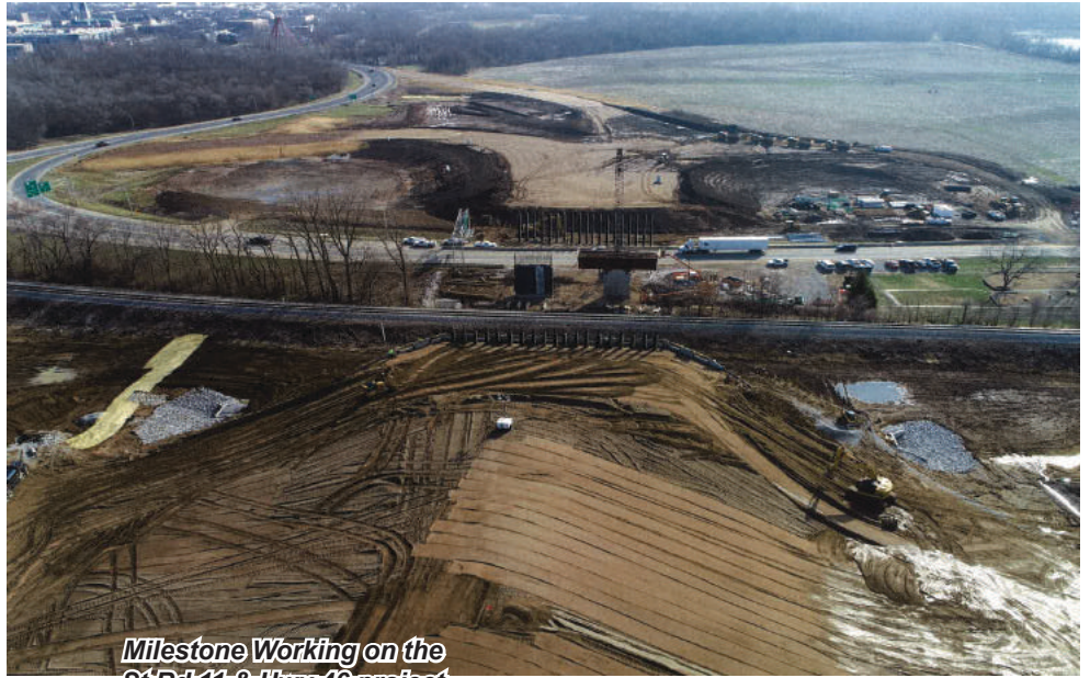
Milestone Working on the St Rd 11 & Hwy 46 project in Columbus, IN.