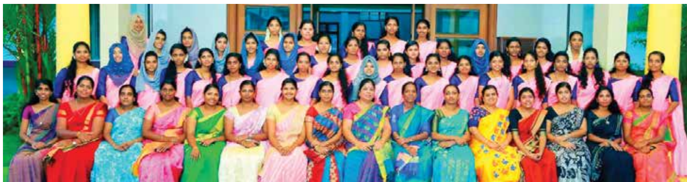
Final year ANM Students with Teachers

Farewell was given to ANM II year by their Juniors on 08/08/2019