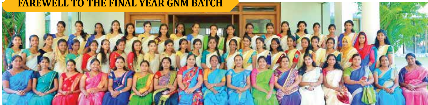
Final years with faculty on Farewell

On November 28 th we had a farewell to our GNM batch from new syllabus third year GNM programme. All the immediate juniors organized the programme with playful events and snacks. Farewell messages were given by the principal Mrs.