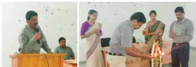
Orientation Program – Pharm D Program