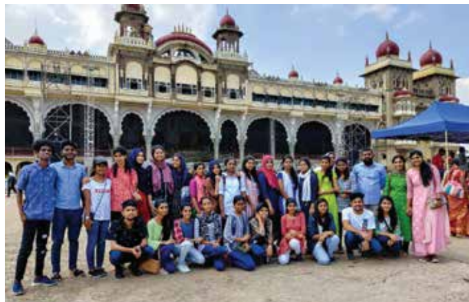
College Tour- Second Year D Pharm (2017 batch)