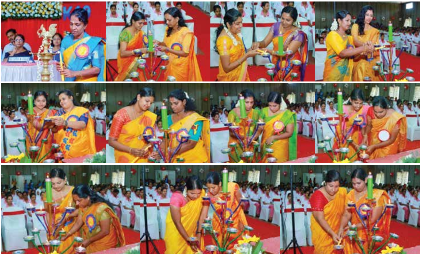
Our Principal & Staff Lights the lamp of passion & intellect