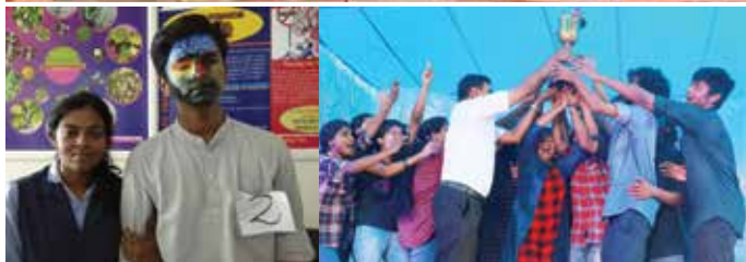
PRANAHAH- Arts Day 2019

B Pharm and Pharm D students participated in Dance Competition organized by College of Engineering, Cherthala and secured second prize in Zealous 2K19 on 14th March 2019.