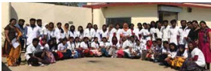
Industrial Visit at Kwality Pharmaceuticals, Amritsar

Third Year B Pharm and Fourth Year Pharm D students visited Kwality Pharmaceuticals, Amritsar on 7th March 2019.