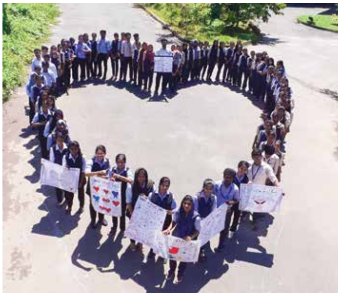
World Heart Day - Every Heart Beat Matters

The Students were inspired by the creativity and with the constant encouragement of faculties, they joined forces to make a heart promise and made the public aware “ My Heart Your Heart” and encouraged them to become a hear hero. Because we believe Every Heart beat Matters.