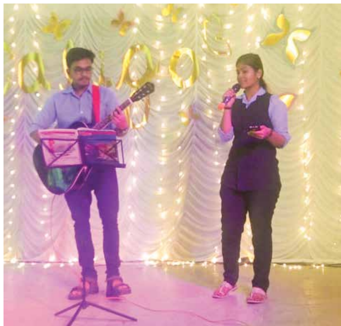
Fresher' Day Celebration – First Year Pharm D