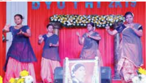
Mind-blowing performance by the Students