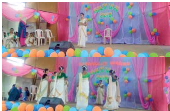
Exploring the talent by 1st year GNM & ANM Students