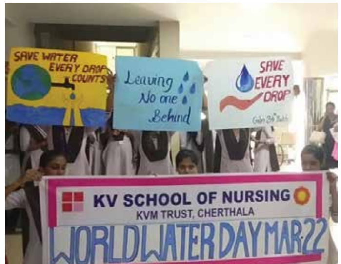
Flash mob at KVM hospital

The students of third year GNM conducted a flash mob at KVM hospital OP premises to convey the message of conservation of water and each drop of water.