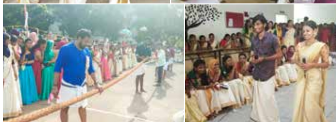
ONAM CELEBRATION -2K19