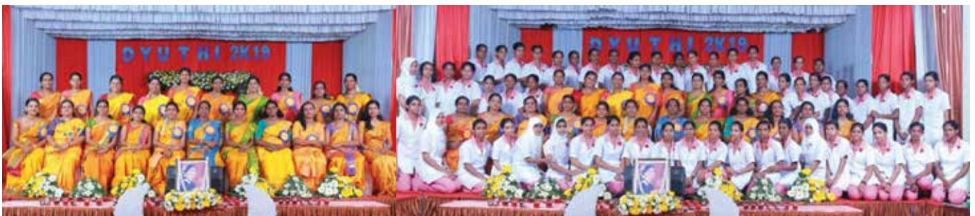
Teachers and Brimming Buds