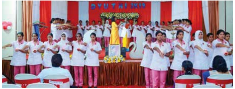
Brimming buds with lamp & taking oath