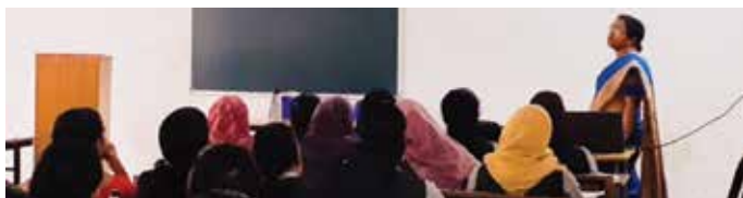
Guest Talk-Plant Tissue Culture