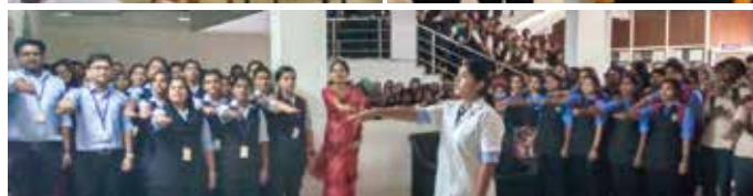
Pharmacist Day Celebration 2019