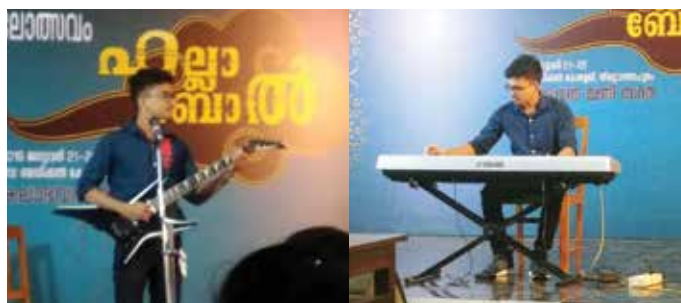
South Zone Arts Meet