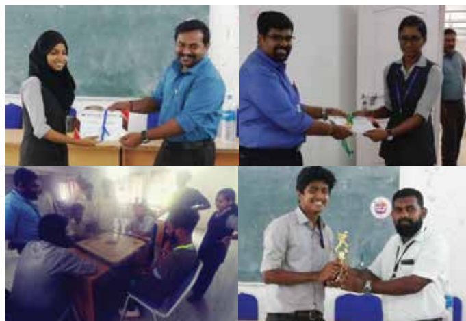
Sports Meet -2019