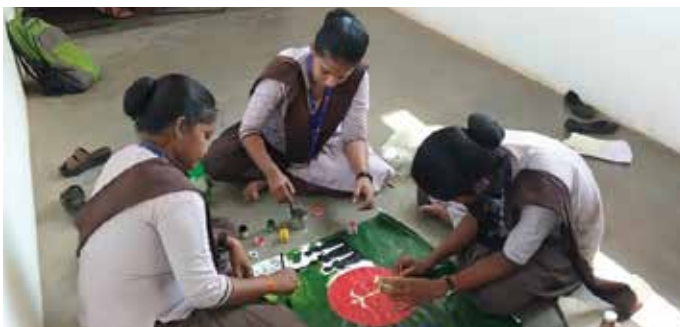
Preparation for Women's Day Poster Presentation