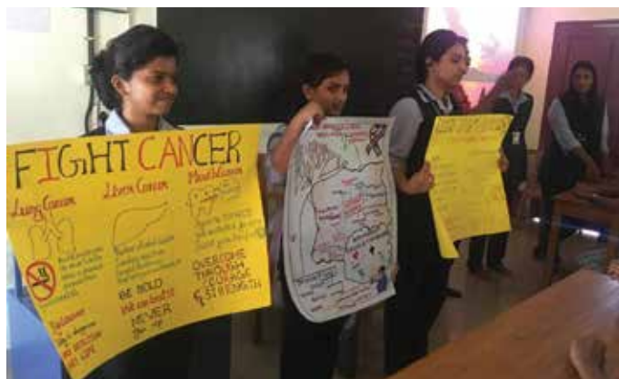
World Cancer Day