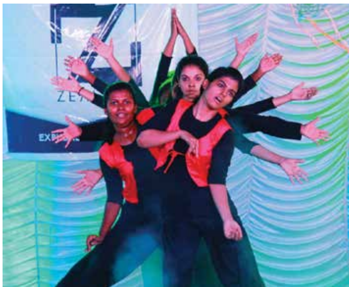
Dance Competition at College of Engineering, Cherthala

B Pharm and Pharm D students participated in Dance Competition organized by College of Engineering, Cherthala and secured second prize in Zealous 2K19 on 14th March 2019.