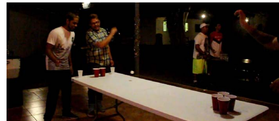
Above: The annual Rose & Crown wine tasting this year attracted nearly 300 people. The event was held both Friday and Saturday at Rosie's Taste 4 Life. Left: The Mule Yard on Saturday hosted a lively beer pong tournament. Top left, below: The Plantation Christmas Market on Sunday attracted a huge crowd despite the rain.

The last weekend of November was already showing signs of a jam-packed holiday season, with a variety of events packed into the final three days of the month.