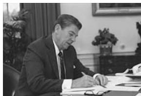
President Ronald Reagan.

The Cold War brought to the forefront many myths and legends in the form of propaganda from both sides of the ideological divide. Both the Soviets and the Americans used these myths and legends as a way to manipulate their respective constituents in order to advance their own agenda. The Cold War is a topic in which historians have just begun to scratch the surface of knowledge. Many debated how the world would be a different and better place once the war was over. For this reason, many people tried to force an end to the