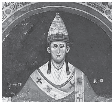
Pope Innocent III.

The first of the four points deals with the nature of the Albigensian apostasy. What exactly was the heresy perpetrated by the Cathars? A close examination of the scholarship on the subject reveals exactly what the Cathars believed and why it was so infuriating to the Church in Rome.