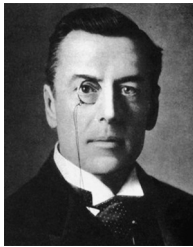
Right Honourable Cecil John Rhodes.

involved. This was a challenging question particularly for some groups in Britain during the South African War (also known as the Anglo-Boer War), 1899-1902. In the South African War, an anti-war movement in Britain came out publicly against their country's war with the two independent Boer republics, the Orange Free State and the Transvaal (also known as the South African Republic). The Boers, or Afrikaners as many called them, were a mixture French, Dutch, and German descent. Many of them had lived there since the 1600s, when they had migrated from Europe because of religious persecution as well as a desire for political freedoms.