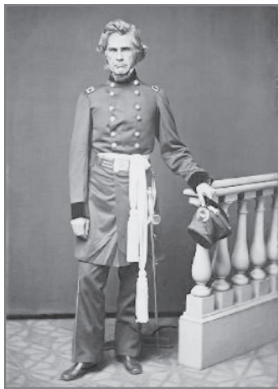
Brigadier General Ormsby Mitchel.

Typically, when people think about the Civil War, Northern Kentucky is rarely mentioned. Names like Bull Run, Antietam, and Chickamauga are at the forefront of discussions and debates. These great battles had lasting effects on the Union and Confederate war efforts and on the outcome of the war. Cincinnati was a key railroad hub for commerce in the Union States, and considerable effort was placed on securing the area around Cincinnati. This was to ensure that the rail hubs did not fall into Confederate hands and cut off the critical supply line north. This is significant because the Northern Kentucky area is not widely known for its role in the Union's war effort. Most area residents have no idea that Northern Kentucky was involved in any way. In fact, if Cincinnati had fallen to the Confed-