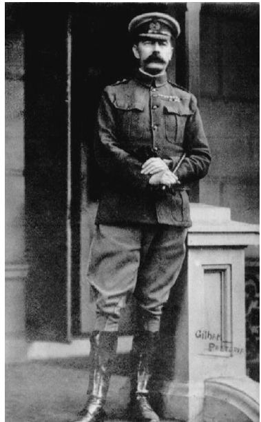
General Right Honourable Viscount Kitchener.