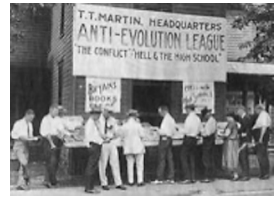
An anti-evolution protest.

The theory of evolution is the majority view in America as to the question of origin, in spite of the predominance of Christianity—a religion traditionally at odds with evolution. The acceptance of evolution has long been explained by pointing to scientific evidence that is continually surfacing in support of it. However, evolution has found its way into the belief system of Americans by an altogether different means. Darwinism's reception has come by way of systematically marketing it to the masses and by philosophically reconciling it with Christianity.