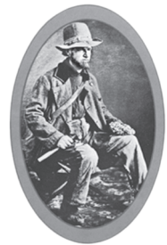
Colonel Charles Whittlesey.

Because of this lack of recognition, important structures, earthworks and battlefields are passed by, ignored or in the case of 23 of the 28 redans (earthworks for cannons which were built for the artillery batteries located across Northern Kentucky), simply destroyed to make way for modern structures. A Civil War fortification known as Battery Hooper in Fort Wright is an important link to the past. Through literature research and archaeological excavation, local archaeologists and historians hope to uncover the history and layout of Battery Hooper as well as the events that surrounded it. The City of Fort Wright, Northern Kentucky University, and the surrounding community are all working towards preserving this local treasure.