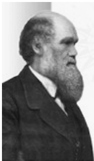
Charles Darwin.

Though many other evolutionary theories preceded his time, Charles Darwin is undoubtedly credited for popularizing and giving an organized, working definition and survey of evolution. 1 In fact, strong arguments have been given supporting the idea that even well over 2,000 years ago, Greek philosophers proposed evolutionary theories, as unorganized as they were. 2 The evolutionary theory is an elaborate paradigm that seeks to answer the question of how everything began. There are numerous variations of the theory of evolution, and each variation has continued and continues to undergo much alteration. However, some basic principles of the theory emerge in each variation, most of which are inline with Darwin's particular view of evolution. All evolutionary theories maintain that all of life began with one or a few molecules. Predominately,