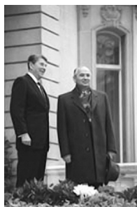
Reagan meets with Mikhail Gorbachev.

Cold War without a nuclear holocaust. Much like other eras in history, the Cold War gave birth to heroes and presented an opportunity for ordinary people to become extraordinary. One such hero of the Cold War is Ronald Reagan.