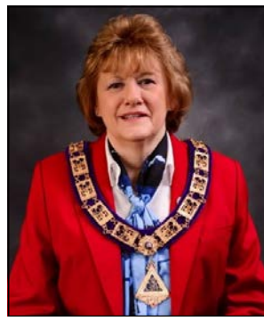
Exalted Ruler Lodge No. 80 2016-2017