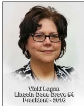
President Drove No. 4 2016