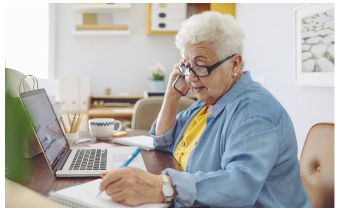
Emeritus lawyers are supervised by a lawyer at an approved legal aid organization, but the rule no longer requires the supervising lawyer to sign each pleading.

The Foundation and the committee hope to