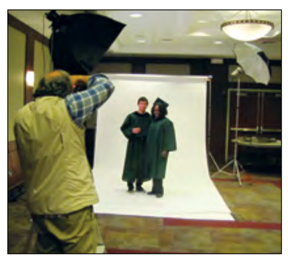
The students who participated in HCCC's photo shoot represented a diversity of our student population.